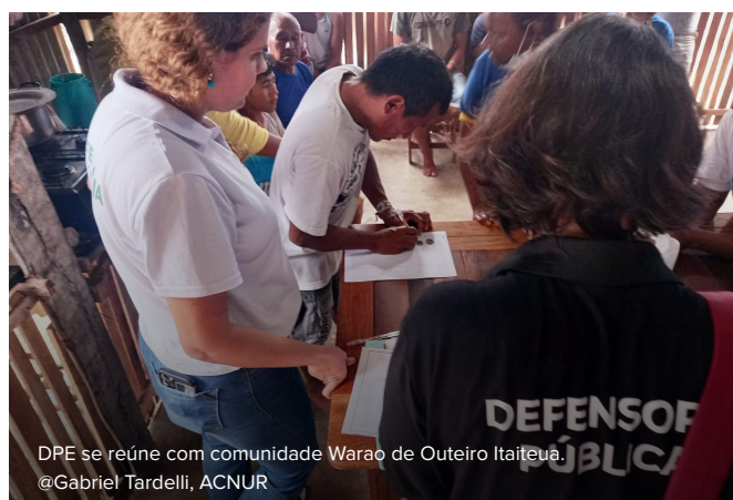
DPE se reúne com comunidade Warao de Outeiro Itaitéua.

On 21 June, in the context of the celebrations for the World Refugee Day, the Legislative Assembly of Pará (ALEPA) unanimously approved the Bill that establishes the state policy for migrants, refugees and stateless people and provides for its objectives, principles, guidelines and priority actions. UNHCR provided technical assistance for the discussion of the bill during the public hearing and, in partnership with the IEB, promoted a meeting to discuss the project with indigenous Warao people who had their comments inserted into the final text approved by ALEPA. On 12 July, the law was sanctioned by the Government of the state of Pará.