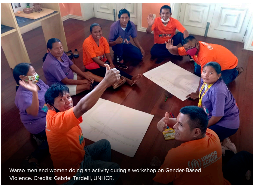
Warao men and women doing an activity during a workshop on Gender-Based Violence.

On 3 May, UNHCR, along with the International Institute of Education of Brazil (IEB), the Federal Public Defender's Office (DPU) and the Public Defender's Office of the State of Pará (DPE), began the second module of the Indigenous Warao Leadership School. During the classes, held at Centro Universitário do Pará (CESUPA), the Warao had the opportunity to learn a more about issues related to access to justice, land and housing. In total, 25 indigenous people participated, among men and women of different ages. The classes took place in May and June and, in addition to face-to-face meetings, the methodology involved Community Time activities, allowing students to perform actions in their own communities by putting into practice what was discussed in the classroom.