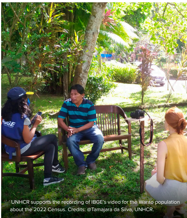
UNHCR supports the recording of IBGE's video for the Warao population about the 2022 Census.

UNHCR has been working in partnership with the Brazilian Institute of Geography and Statistics (IBGE) to support the institution in registering indigenous refugees and migrants living in Pará. On 18 and 24 May, UNHCR promoted face-to-face and virtual training for IBGE area coordinators in the State, having made important contributions to the adaptation of the methodology implemented by the Institute for data collection. The training presented historical and anthropological aspects about the displacement and presence of the Warao in Brazil, and promoted reflections about the possible challenges that may be faced by the census workers while conducting the CENSUS, which will take place between 1 August and 31 October.