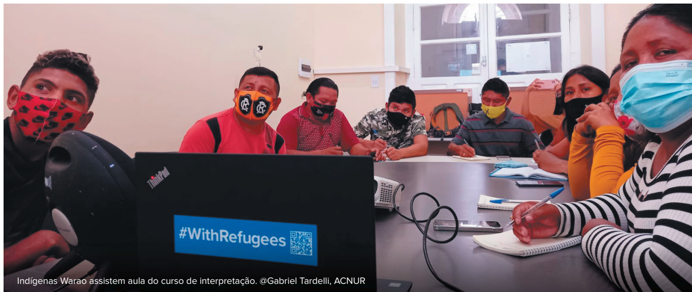
Indígenas Warao assistem aula do curso de interpretação.