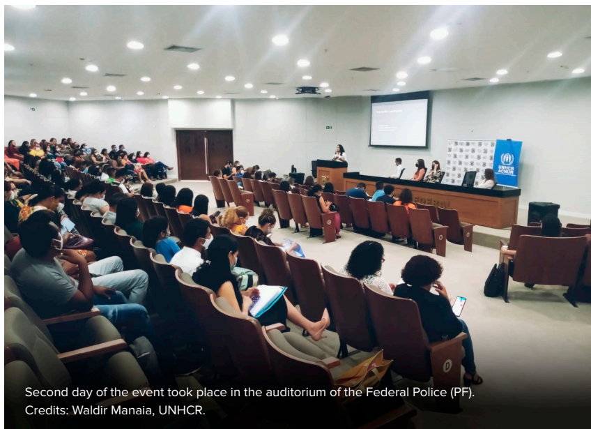
Second day of the event took place in the auditorium of the Federal Police (PF).

On 28 and 29 April, UNHCR and the State Secretariat for Justice and Human Rights (SEJUDH) held a training course in the auditorium of the Superintendency of the Federal Police of Pará to the protective networks of 15 municipalities in Pará. During the two days of the event, about 140 participants had the opportunity to meet and discuss issues related to legal frameworks, documentation, access to justice and assistance to access safe housing for the refugee population. The event had contributions from UNHCR partner entities such as the Immigration Federal Police Department (DELEMIG), the General Coordination of CONARE (CG-CONARE), State and Federal Public Defenders and State Prosecutor's Office (MPPA).