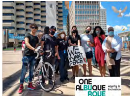
©Albuquerque, United States

Description: This initiative aims to facilitate and embrace equity at all levels. The Office of Immigrant and Refugee Affairs holds bi-monthly COVID response meetings. This is a space to discuss topics of high relevance in immigrant and refugee communities. Meetings follow an agenda (introductions, data sharing, experts' briefings, Q/A, discussion and announcements) and invite community members, non-profit organisations, city employees, Board members from the local school district, elected officials and other local partners. Moreover, the city is preparing for the upcoming arrival of Afghan refugees to Albuquerque.