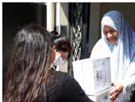
©Buca District, Izmir, Turkey

Description: The Refugee Support Desk (RSD) promotes access to basic services and inclusive and integrated systems among municipal departments. The RSD addresses barriers refugees face in accessing services, including through language support. Since its inception, the RSDs have provided counselling to more than 5,000 refugees on access to rights and benefits in Turkey. Nearly 1,000 vulnerable refugees have been identified and referred to the relevant authorities. The Municipality distributed hygiene and food kits to refugees and host community members who were seriously affected by COVID-19.