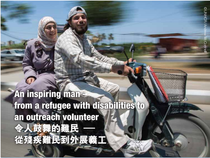
An inspiring man from a refugee with disabilities to an outreach volunteer 令人鼓舞的難民 —— 從殘疾難民到外展義工