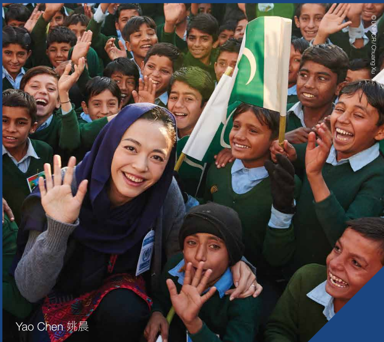
Yao Chen 姚晨

為紀念敘利亞衝突爆發五週年，安祖蓮娜祖莉彼特到黎巴嫩的貝卡山谷探訪難民，探視目前生活在Fayda鎮難民臨時安置所的難民家庭。在記者會上，她感謝黎巴嫩人一直以來為無數的敘利亞人伸出援手，強調敘利亞難民流離失所的問題仍在不斷惡化，及彰顯了這些家庭在多年的流亡生活中掙扎求存的困境。安祖蓮娜祖莉彼特繼而表示，明白各國人民對難民湧入的情況感到憂慮，但同時指出有必要通過理性、冷靜和具遠見的方法有效地應對危機。最後，她呼籲各國政府帶頭正視在敘利亞以及全球更廣泛地域的難民危機，並嘗試通過外交尋求解決方案，同時認真思考怎樣能為逃避迫害和衝突的人們做得更多。