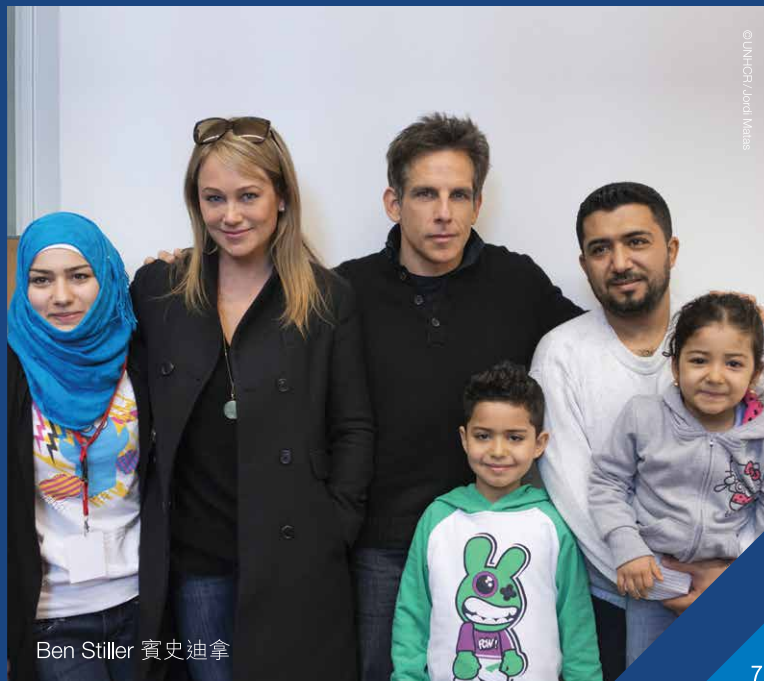
Ben Stiller 賓史迪拿