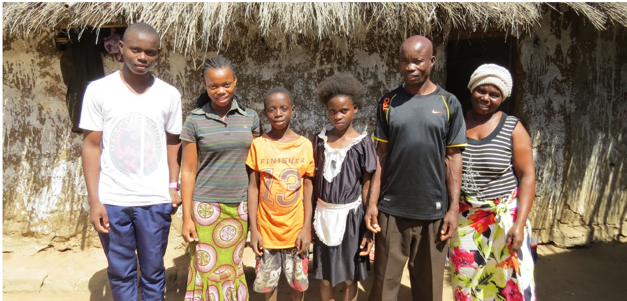
A refugee family outside their home in the Maratane Refugee Camp.