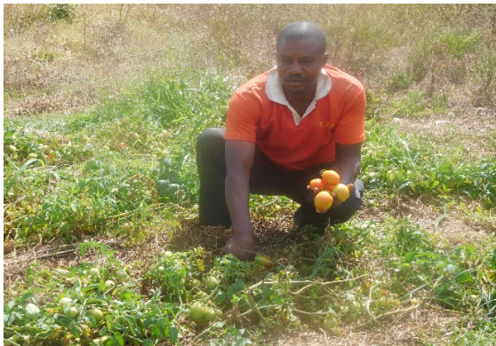
A refugee harvesting tomatoes from his farm.

5. The use of agricultural inputs is very low among the hosts. While just 14 percent of host farmers used agricultural inputs, nearly half of refugees did. Among users, the most common input used was fertilizer – about 8 percent of hosts and 44 percent of refugees used this. Some 7 percent of hosts also used pesticides and 3 percent used irrigation, compared to 35 percent and 16 percent among refugees, respectively. Some refugees benefited from a UN Food and Agriculture Organization (FAO) programme and received agricultural inputs such as fertilizer, which could explain their higher utilization of agricultural inputs.