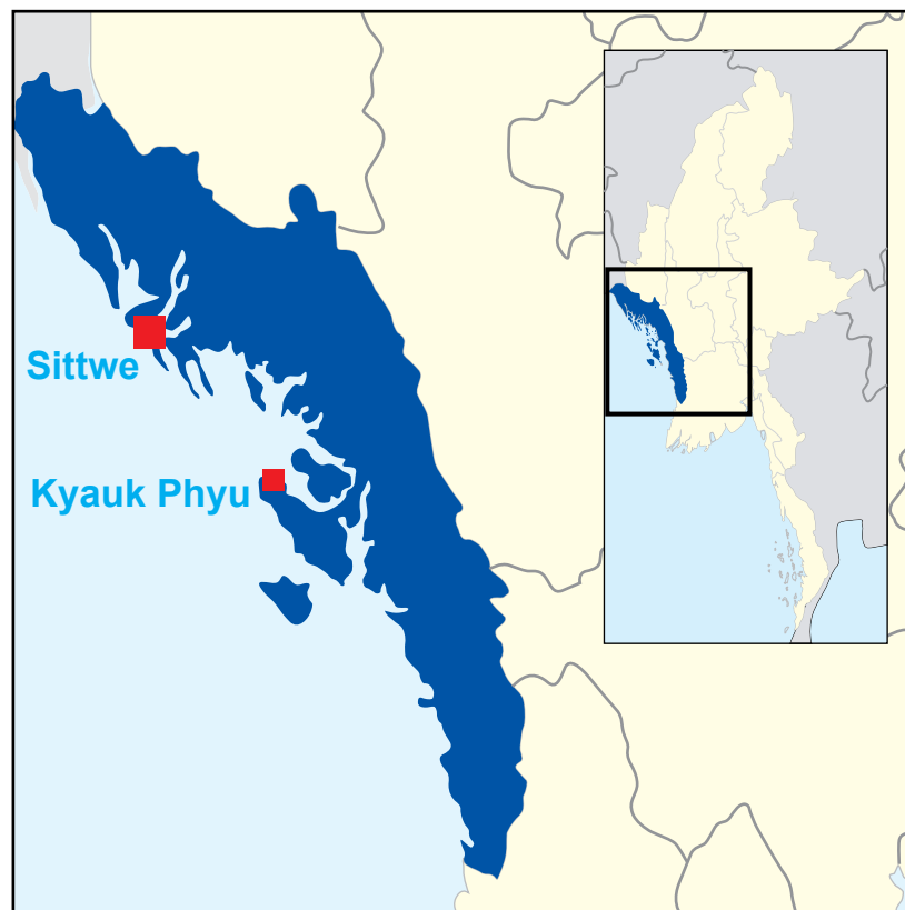
Map edited by the ICJ (original by Radio Free Asia)