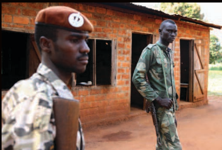
UPC fighters outside a kindergarten in Ngadja, Ouaka province. The fighters have used the building as a base since October 2014.

In June 2015, the Central African Republic endorsed the Safe Schools Declaration, which commits governments to protect schools from attack and military use. Now the government and UN mission should do more to ensure that schools are protected and that children get the education they want and deserve.