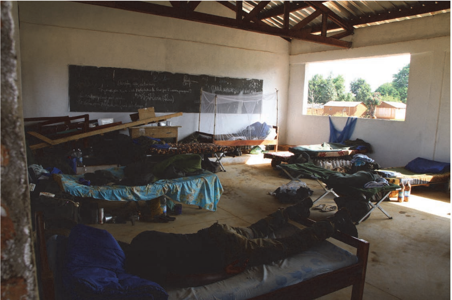
UN peacekeepers from the Republic of Congo using a school building in De Gaulle, in Ouham-Pendé province, as their base in November 2016. The forces left the school after Human Rights Watch informed UN authorities.

In November 2016 and January 2017, Human Rights Watch visited 12 schools that were either occupied by an armed group, had previously been occupied by an armed group or the group was in the immediate area, preventing students from attending. While some of these schools were operational, teachers and parents told Human Rights Watch of frequent closures that prevented children from attending class.