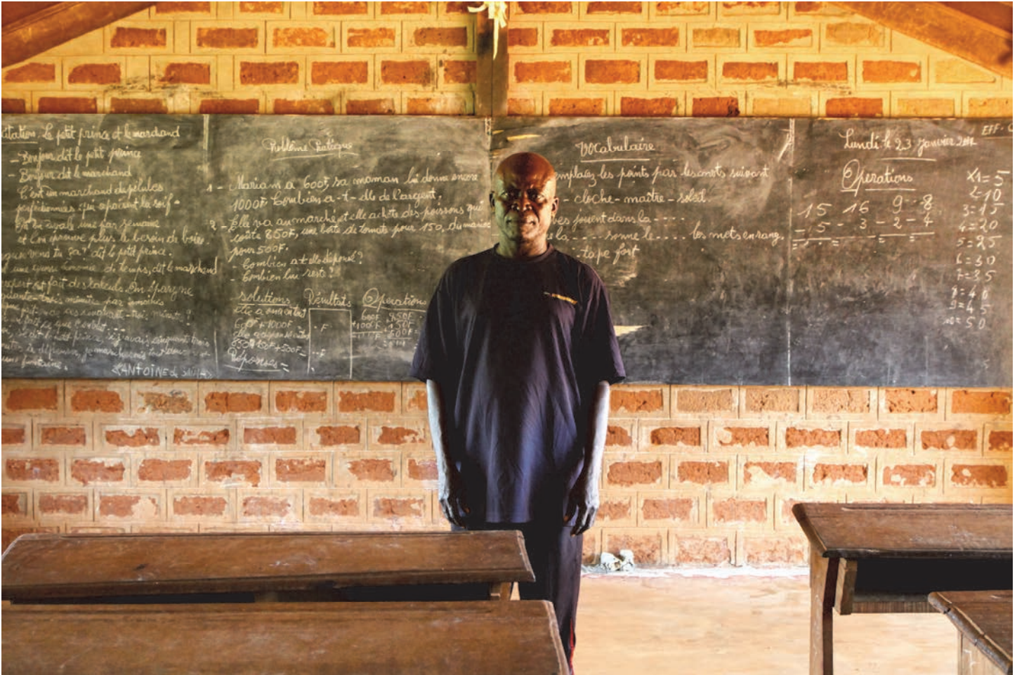
A school director in Ouaka province who said fighters in the area scare children and their parents. “If the Seleka were not here at the school, then parents would send their kids to study,” he said. “But right now, we have hundreds of students who do not come.”

In line with UN Security Council Resolution 2225 on children and armed conflict, the Central African government should take concrete measures to deter the military use of schools, including requesting assistance from the UN peacekeeping mission. In June 2015, the Central African Republic endorsed the Safe Schools Declaration, which commits governments to protect schools from attack and military use. This was an important step that spurred the UN peacekeeping mission in the country to begin clearing schools occupied by militias. Although the UN mission had a number of successes in 2016, progress was undermined by cases of peacekeeping forces themselves using school buildings as bases and barracks, in violation of UN rules.