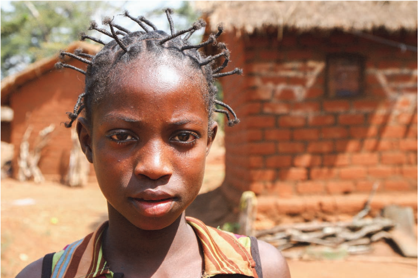
A 15-year-old girl from Nana-Grébizi province, who has not attended school since 2013. “I want to be a teacher because they are important for the community and because they are respected,” she told Human Rights Watch. “But now, I don’t know what I can do, I just stay at home all day.”

The Seleka received new guns on January 13 [2017] and they were shooting them. We were in class when they started shooting behind the school. We wanted to run, but the teachers told us it was safer to stay down in the class room. I am scared to come to school. I am scared the Seleka will attack me. I often ask myself, “Should I even bother to go to school? Is it worth the risk?” 29