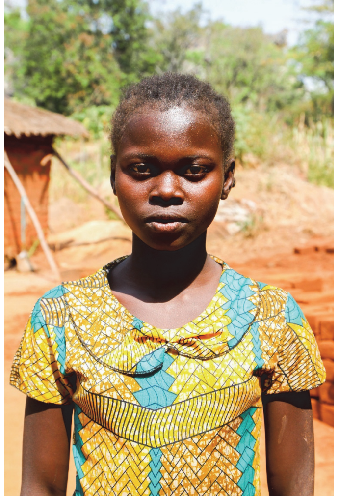
A 13-year-old girl from Nana-Grébizi province who has not attended school for four years. “With the school closed I don’t feel like I can be smart anymore,” she said.

Another parent from Zoumanga concurred. “The presence of the Seleka makes it too dangerous for our kids,” he said. “A gun could go off, a child could stray too close to the Seleka and they could shoot him, or the Seleka could be attacked and shooting could start.” 44