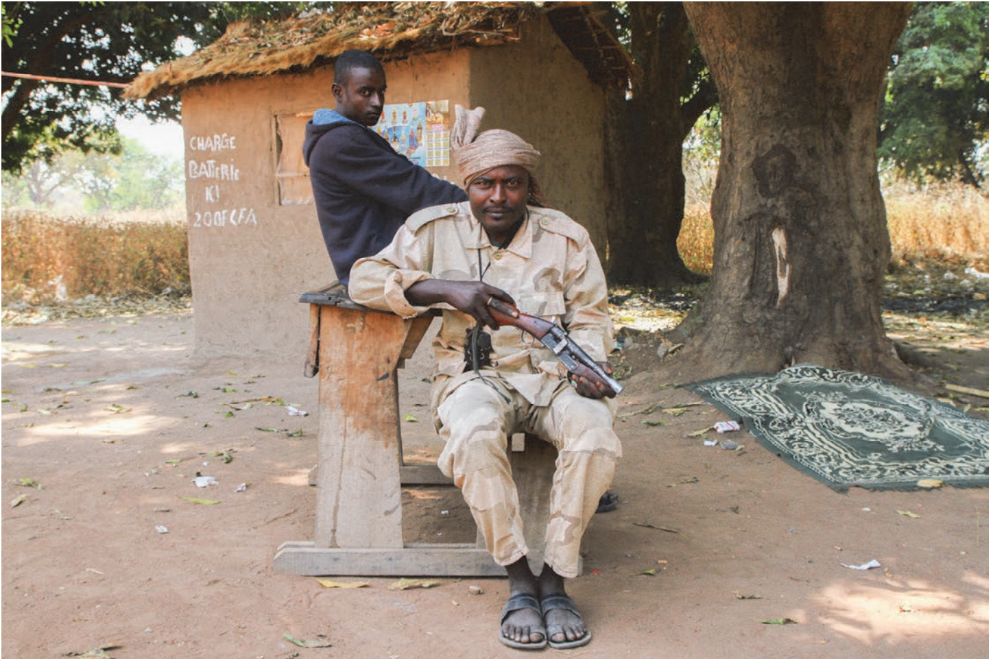
Seleka MPC fighters at a roadblock in Bojomo, Ouham province, with a desk they removed from the local school.

the Seleka, but in recent months some anti-balaka have made alliances with some Seleka splinter groups.