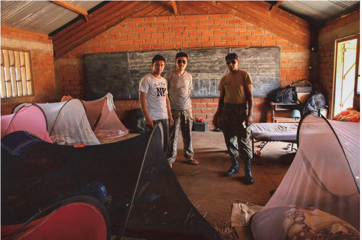
United Nations peacekeepers from Pakistan using a school building in Mourouba, Ouaka province, as their base in violation of UN guidelines and regulations. The forces left the school in January 2017 after Human Rights Watch informed UN authorities.

During a visit to the town on January 22, Human Rights Watch researchers saw MINUSCA peacekeepers from Pakistan using the school grounds as their base. Residents told Human Rights Watch that they want the peacekeepers to stay, but they also want to send their children back to school. One parent explained: