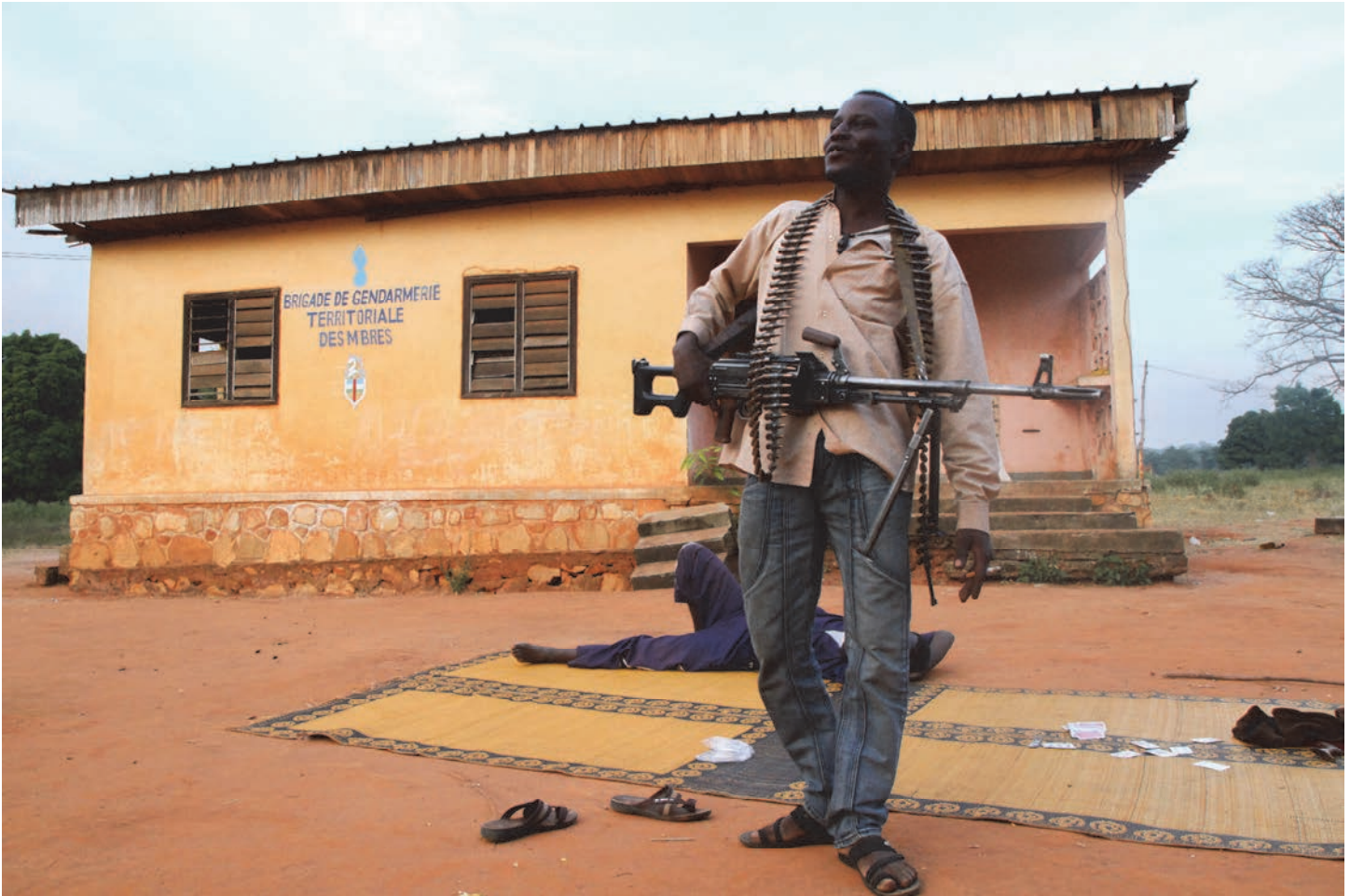
Fighters from the Central African Patriotic Movement ( Mouvement Patriotique pour la Centrafrique , MPC), a Seleka group, in Mbrès, Nana-Grébizi province, who are based next to two schools. All schools in the town are closed because fighters often occupy the buildings.

violent militia. The group frequently targeted Muslim civilians, associating all Muslims with the Seleka. 4