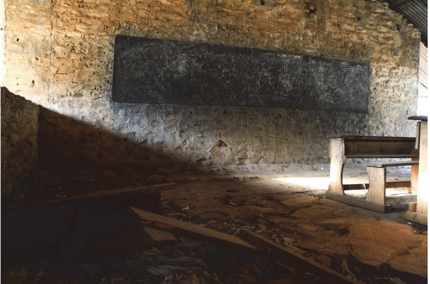
The boys primary school in Mbrès, mostly closed since 2013. Seleka MPC fighters left the school building in December 2016 but are based meters away.

The Seleka took the school in 2013. Some time back we asked the Seleka to leave the school, and the fact that we asked made them angry so they made a big fire and burned all the desks and the books. Now the school is functioning, but we don't have enough books or documents with which to teach. 53