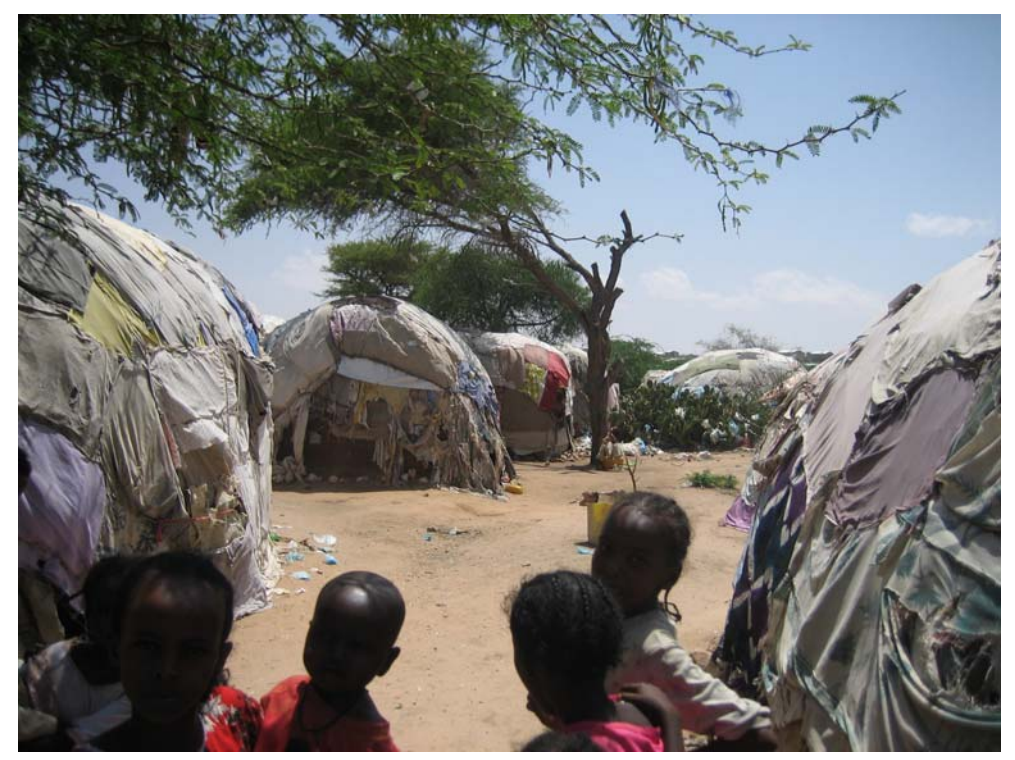
A camp for displaced persons, Somaliland

The Government of Somaliland possesses primary responsibility for the protection of displaced persons in Somaliland. Under the UN Convention Relating to the Status of Refugees, refugees have the right to be treated as favourably as possible, and not less favourably than aliens generally in the same circumstances with regards to housing (Article 21), public education (Article 22) and public relief (Article 23). These duties have been strengthened by UNHCR executive committee general guidelines (including 108), which call on states to take steps to prevent acts of violence against refugees, safeguard their physical safety and to facilitate access to effective legal remedies. <sup>19</sup>