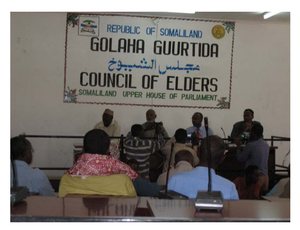
A meeting of the Guurti, the House of Elders, in May 2007

The Upper House of Parliament, the House of Elders or Guurti , maintains a Committee on Human Rights. Members of this committee have told Amnesty International that it functions as an oversight body to monitor the human rights record of the executive branch, as well as adherence by individuals and institutions to "individual and collective human rights," perceived to include the right to self-determination for Somaliland.