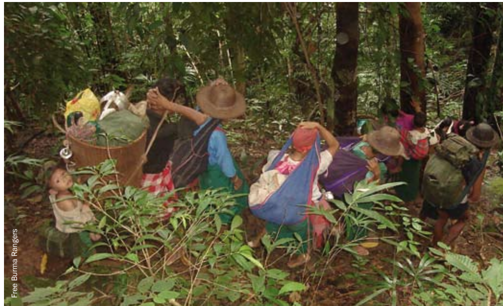
Free Burma Rangers

In the case of Burma, where the national authorities are largely responsible for the displacement, the IDP issue has acquired political