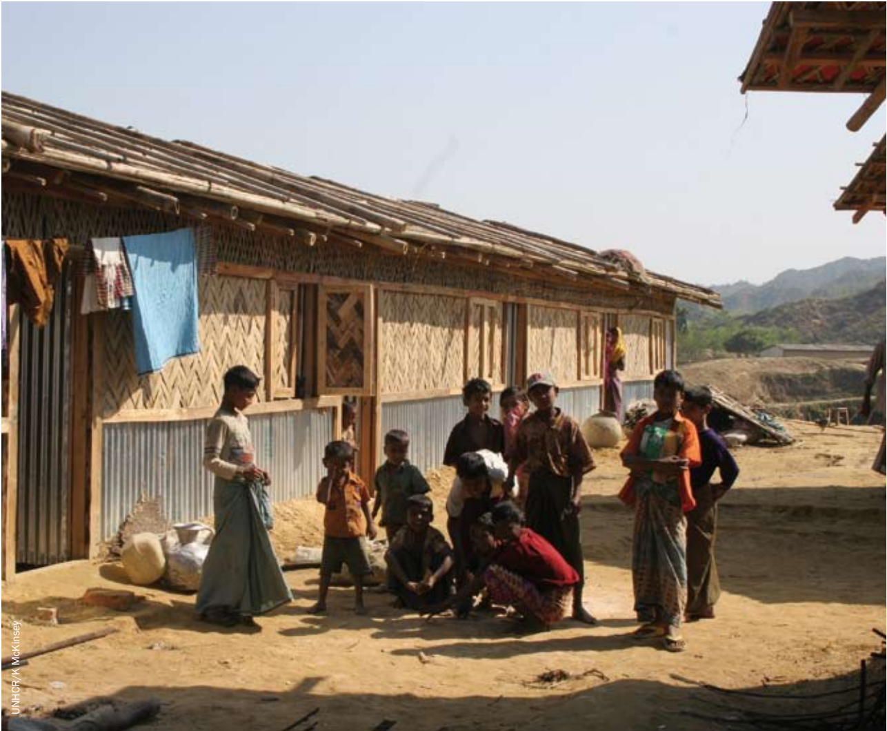
Burmese refugee children play in front of new houses built with UNHCR funding in Nayapara refugee camp, Bangladesh, February 2008.

Since that agreement was reached, UNHCR has been successful in starting to raise funds – and construction in the two refugee camps has begun. It is hoped that both camps will have new accommodation facilities by end of 2009.