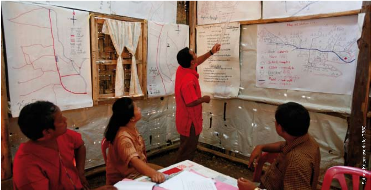
Karen Refugee Committee meeting, Site 1, Mae Hong Son Province, Thailand