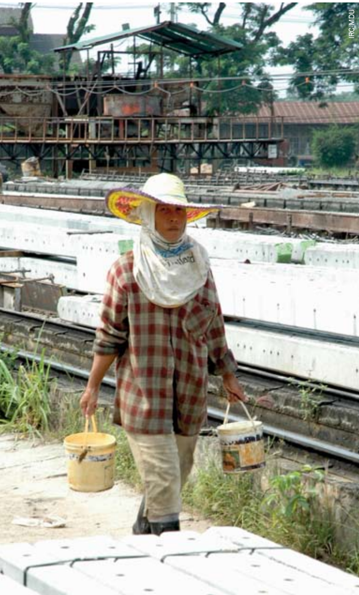
Burmese migrant worker in Thailand.

it unethical to probe too deeply in this area. Given this reluctance, it is likely that our results are skewed and that more respondents experienced violence and conflict than were willing to say so.