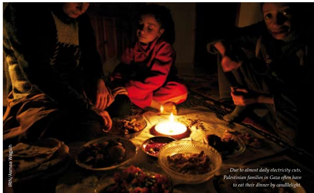
Due to almost daily electricity cuts, Palestinian families in Gaza often have to eat their dinner by candlelight.

In November 2007, the Palestinian Federation of Industries reported the closure of 95% of Gaza's factories and workshops, swelling the ranks