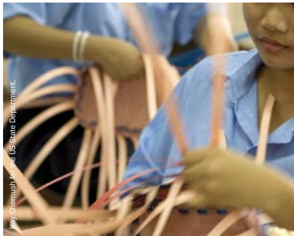
Key Chermush for the US State Department.

Using this definition, trafficking is not always a clear-cut crime. Often people may move willingly, even into labour situations that might be considered exploitative, as a relative