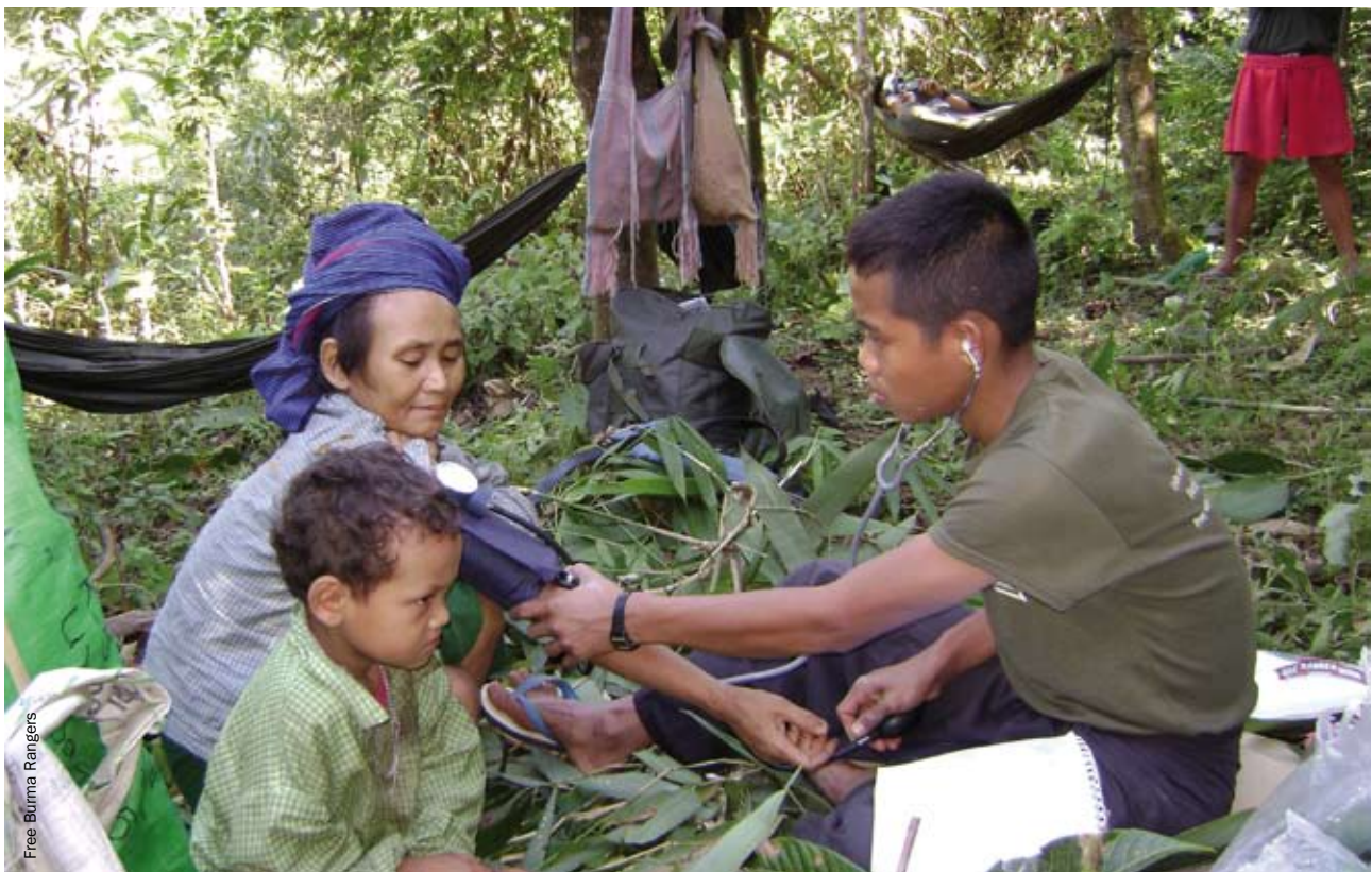
Medical treatment for IDPs in eastern Burma.

As though such challenges were not serious enough, humanitarian organisations operating within Myanmar have also been criticised by agencies and Burmese opposition groups based in Thailand (and by the opposition groups’ supporters in the West). To their credit, Thai-based humanitarian actors, including those providing essential relief to stranded and displaced populations across the border in south-east Myanmar, have historically played a crucial advocacy role on behalf of the victims of military ruthlessness