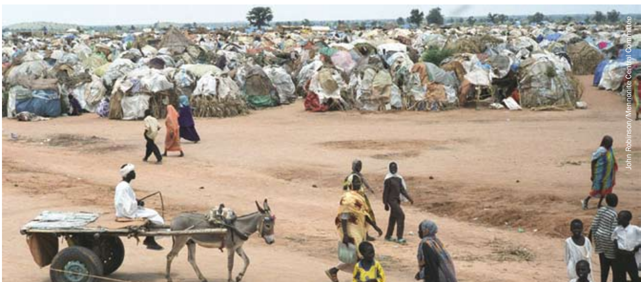
IDPs in Darfur