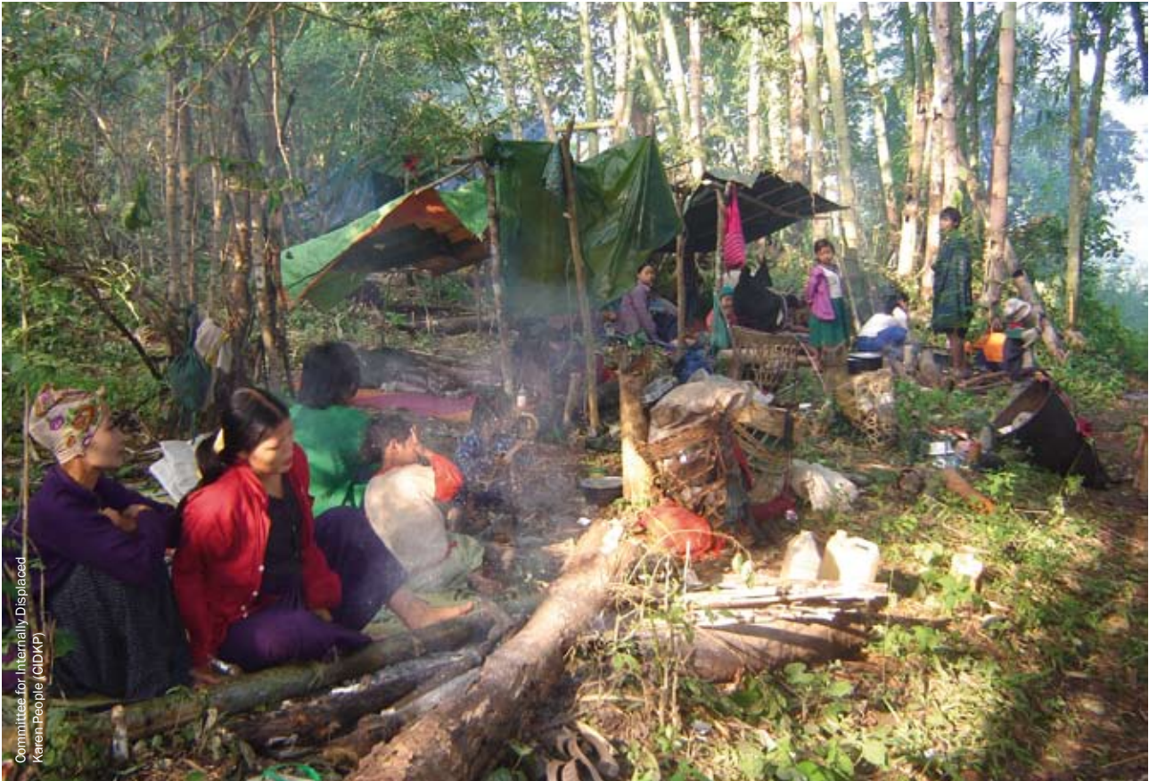
Committee for Internally Displaced Karen People (CIDPKP)