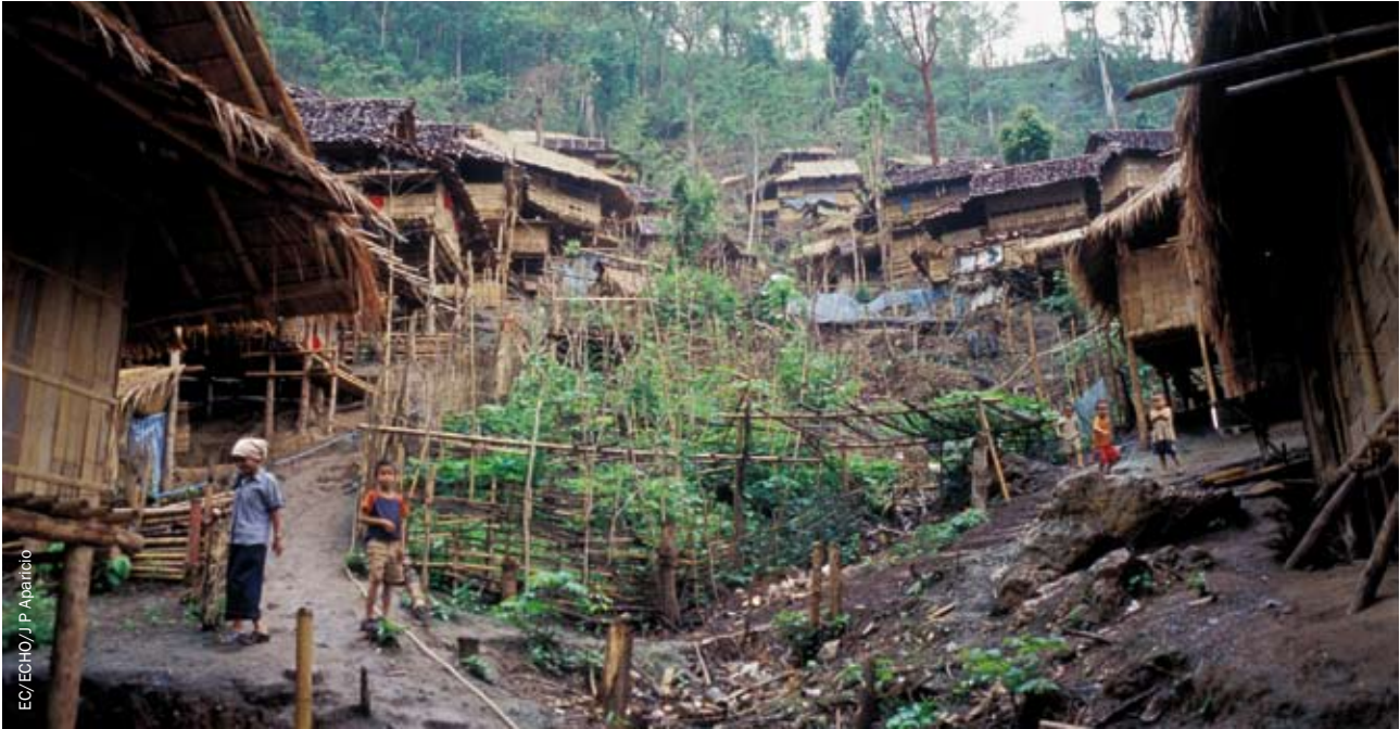
Mae La Oon refugee camp, Thailand

arrivals continued to enter the camps, the focus was on monitoring and standardising systems. The camps' supply management, while in many respects perfectly adequate, no longer met procedures required by donors for tendering, quality control and monitoring. Thus began a long process of re-design, training and implementing new systems to fit with the global humanitarian community's expectations. The systems had functioned on trust and informal agreements. Rejection of these systems implied a breakdown in trust which then had to be re-established.