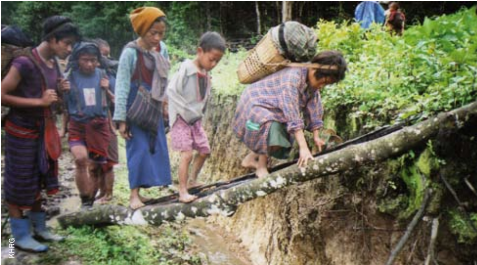
Displaced villagers fleeing the SPDC in Toungoo District.

villagers can learn of the impending arrival of troops and thereby gather belongings and head into the forest prior to the actual arrival of soldiers. Upon reaching relatively secure hiding sites, displaced communities are quick to re-establish schools to educate their children and provide some measure of structure despite the disruptions of a life on the run. Villagers share rice with others who have been unable to bring along sufficient reserves. If they expect to remain for a longer period at one hiding site, villagers often establish small hillside paddy plots or cultivate cardamom, betel nut and other crops which, being relatively small and durable, are practical trade goods for displaced communities.