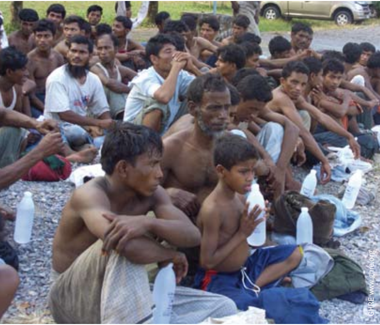
Boat people arrested in Thailand 2008.

Thousands of stateless Rohingyas are leaving Burma and Bangladesh, dreaming of a better life in Malaysia.