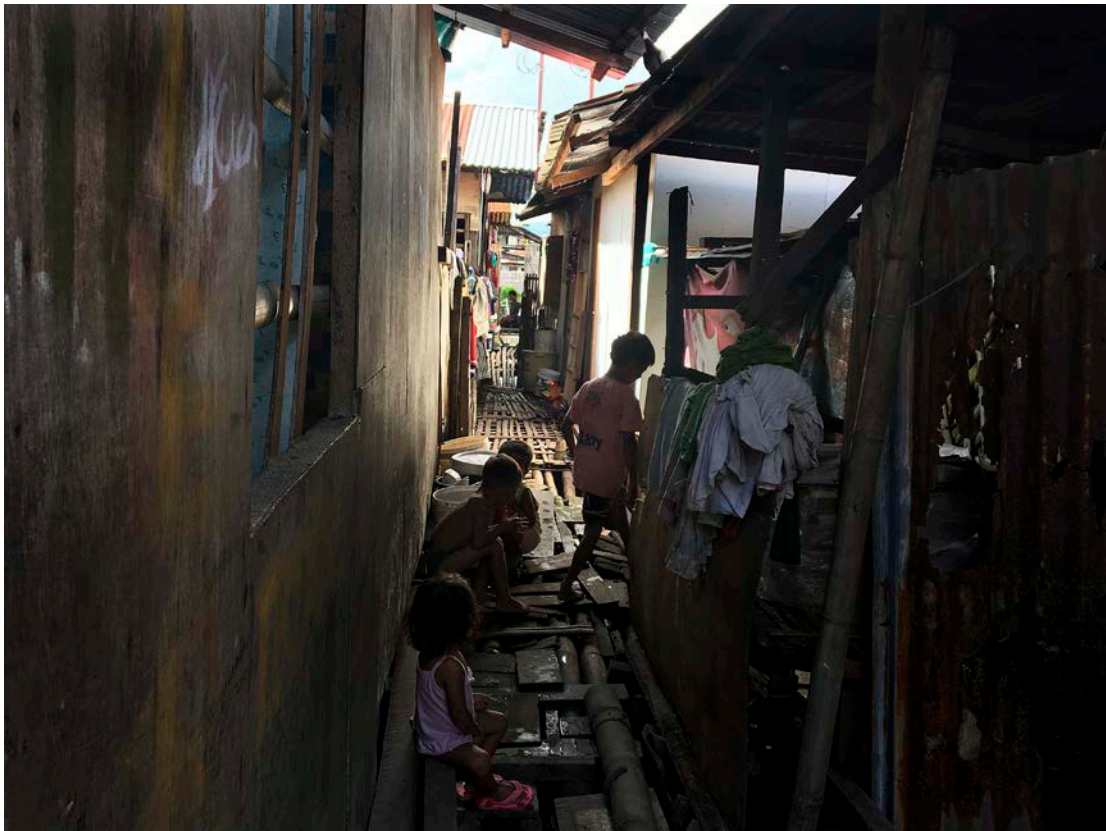
Children play, 8 December 2016, in a floating slum (exact location withheld) where one of the cases of killings by police documented by Amnesty International in Cebu Province took place. Many of the people who have been targeted in the anti-drugs campaign are poor.