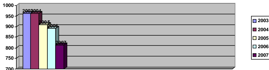
Table 21 Total first-degree murders 26

94. Over the past five years there has been a downturn in the total number of first-degree murders : 963 and 962 such offences were recorded in 2003 and 2004, respectively, and 910 in 2005. In 2006 there were 891 cases, a decline of 5.4 per cent as compared to 2005, and in 2007 the figure was 815, a decrease of 5.3 per cent as compared to 2006.