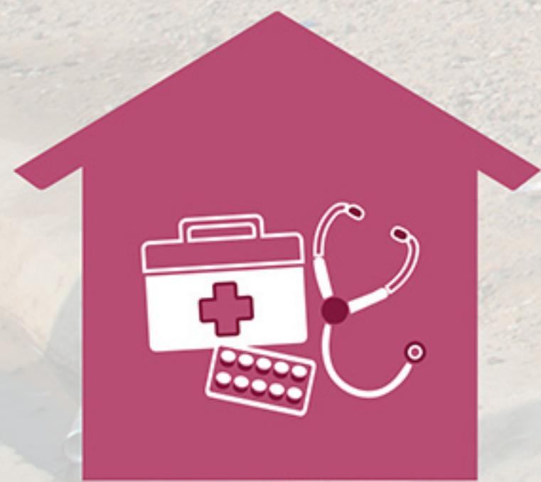
Shelter protects health

With the Syria conflict now in its seventh year and escalating emergencies in countries like Yemen, Iraq, and South Sudan, the need to shelter those forced to flee is as critical as ever.