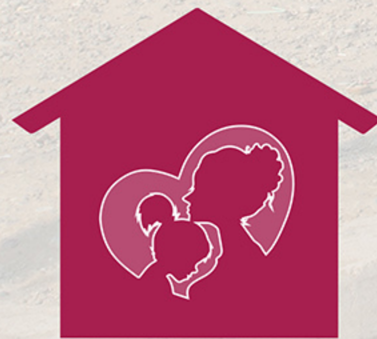
Shelter gives safety & dignity

Families are at risk of disease and epidemics when sleeping out in the open. When refugees do not have shelter, hygiene deteriorates--affecting not only the immune system but also people's dignity.