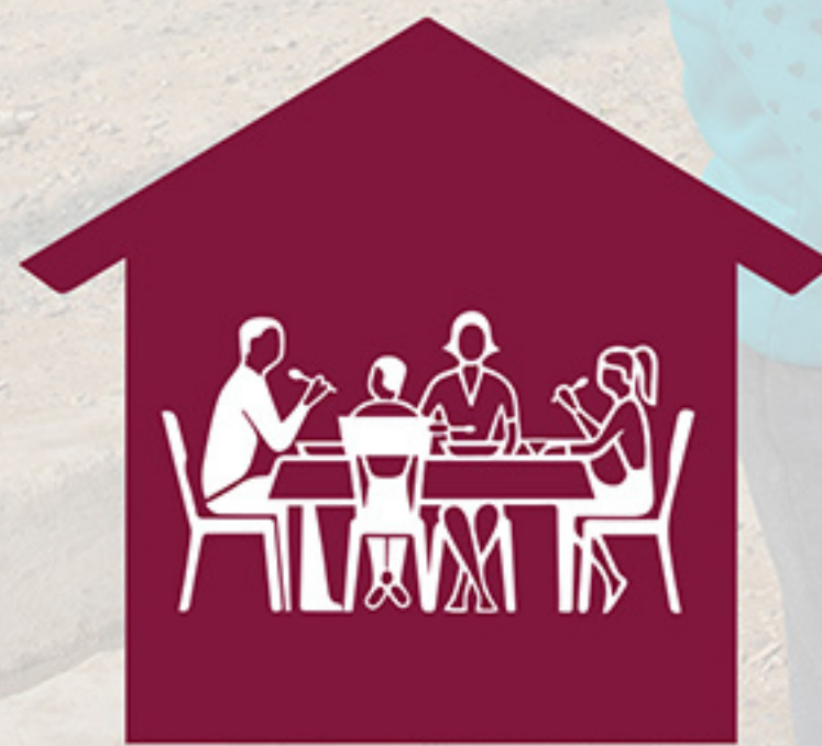
Shelter helps life resume

Without shelter, the risk of sexual violence grows exponentially, since women and girls are exposed and have no privacy. Shelter not only physically improves a woman's degree of safety, it helps them feel safe, which is vital for peace of mind and mental well-being.