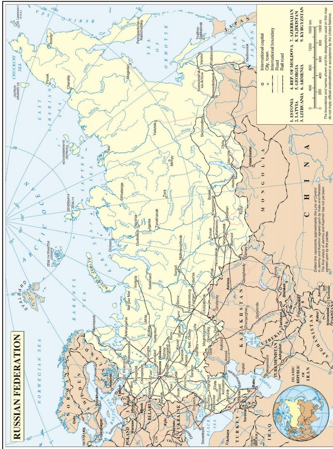
Map 1: Russian Federation - administrative divisions