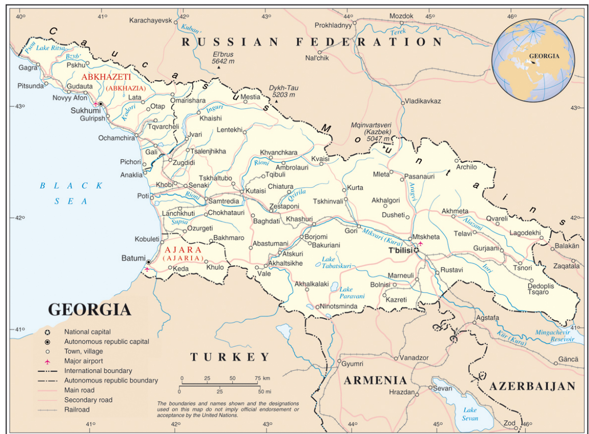
Map No. 3780 Rev. 5 UNITED NATIONS August 2004