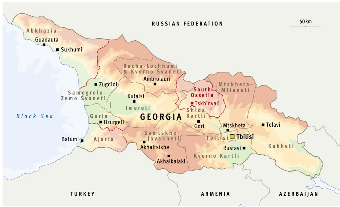
Source: Fischer Weltatlas, Fischer Taschenbuch Verlag, Frankfurt am Main, 2009