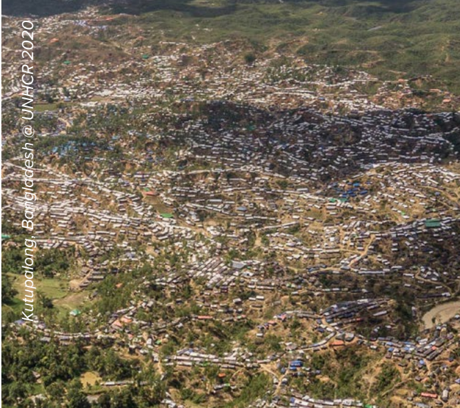
Kutubdia, Bangladesh @ UNHCR 2020

The Geneva Technical Hub (GTH) brings together Swiss academia and expert practitioners to tackle complex technical problems, share learnings, and find solutions that can be applied in diverse UNHCR operational contexts. GTH strives innovative change through new, practical, and trialled approaches, while advancing operational practices through an agile and solutions-oriented approach. Interventions are based on field demand, and solutions proposed will be contextualized and scaled up to promote horizontal learnings between operations.