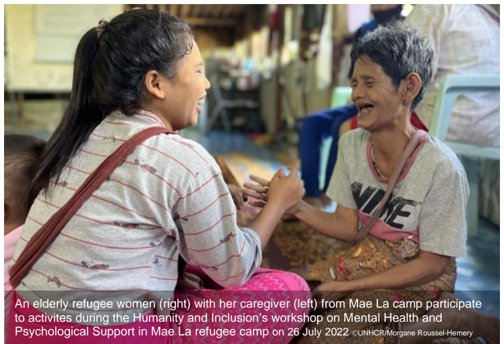
An elderly refugee women (right) with her caregiver (left) from Mae La camp participate to activities during the Humanity and Inclusion's workshop on Mental Health and Psychological Support in Mae La refugee camp on 26 July 2022

2 Field Offices - in Mae Hong Son and Mae Sot