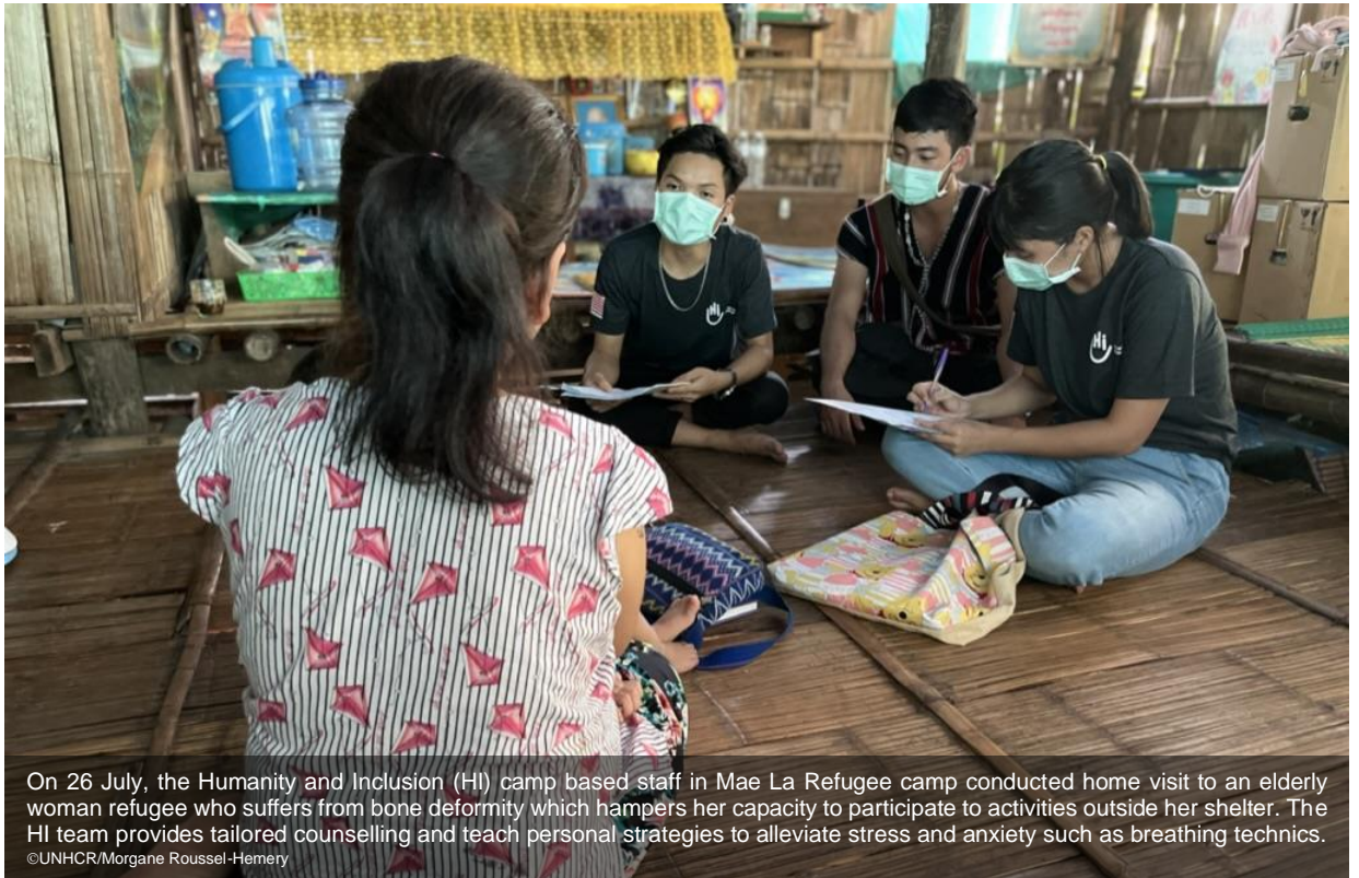
On 26 July, the Humanity and Inclusion (HI) camp based staff in Mae La Refugee camp conducted home visit to an elderly woman refugee who suffers from bone deformity which hampers her capacity to participate to activities outside her shelter. The HI team provides tailored counselling and teach personal strategies to alleviate stress and anxiety such as breathing technics.