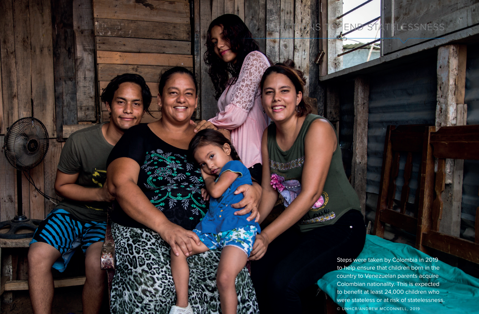
Steps were taken by Colombia in 2019 to help ensure that children born in the country to Venezuelan parents acquire Colombian nationality. This is expected to benefit at least 24,000 children who were stateless or at risk of statelessness.