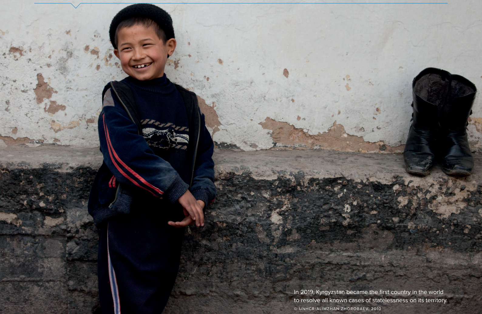
In 2019, Kyrgyzstan became the first country in the world to resolve all known cases of statelessness on its territory.