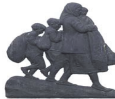
Одделение за азил Section for Asylum