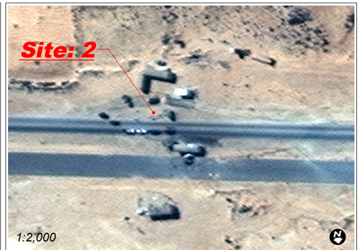
WorldView-02 satellite image recorded 05 March 2011