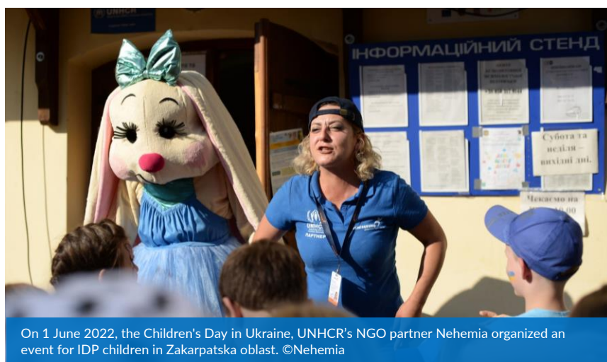
On 1 June 2022, the Children's Day in Ukraine, UNHCR's NGO partner Nehemia organized an event for IDP children in Zakarpatska oblast.