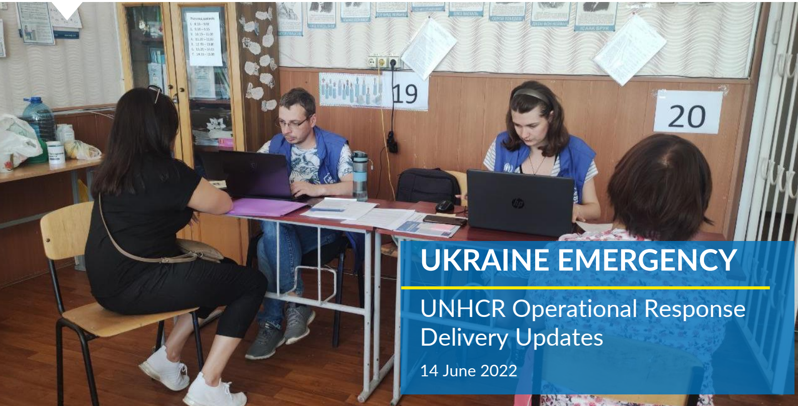
UNHCR's NGO partner Right to Protection is enrolling internally displaced people for UNHCR's multi-purpose cash assistance programme in Kropyvnytskyi, 7 June 2022.