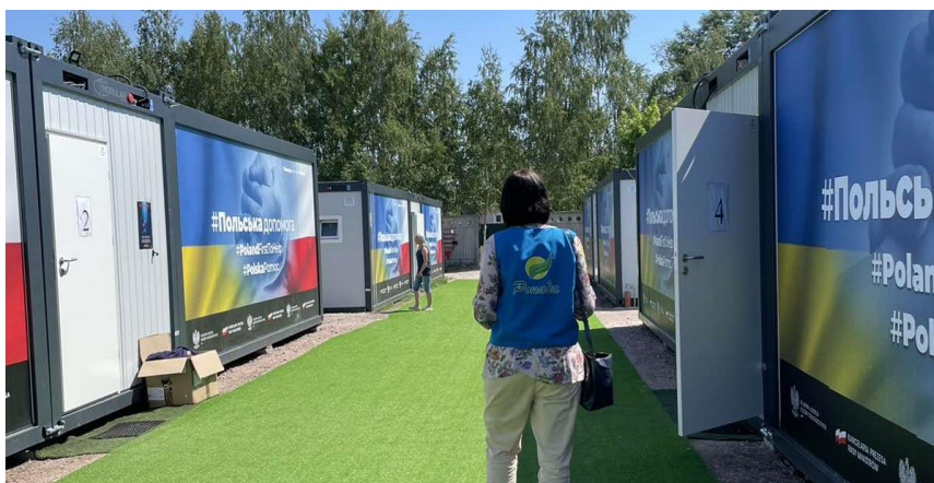
UNHCR's NGO partner Rokada conducted protection monitoring at a modular town in Borodyanka, Kyivska oblast, June 2022.