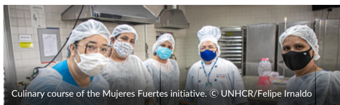
Culinary course of the Mujeres Fuertes initiative.

About 50 refugee and migrant entrepreneurs exhibited their products during the municipal's June festival in Boa Vista, which took place between 11 and 18 June. The space was promoted by UNHCR in partnership with AVSI, Fraternity - International Humanitarian Federation, Fraternity Without Borders (FSF), SJMR, A Casa - Museum of the Brazilian Object, the municipality of Boa Vista and Operation Welcome. The population in Boa Vista was also able to see more products from Venezuelan entrepreneurs at the 3rd edition of the IntegraArte Fair, held in early July at Roraima Garden Shopping.