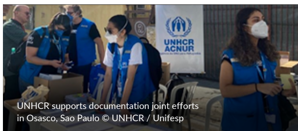
UNHCR supports documentation joint efforts in Osasco, Sao Paulo

Between May and August, UNHCR São Paulo conducted a round of a monitoring process on the access to documentation by refugees and migrants in states in Brazil's South, Southeast and Northeast regions. The information obtained during these monitoring processes will be used to strategically guide efforts such as training local networks, the preparation and implementation of cooperative referral flows - that include Federal Police Departments (DELEMIG), civil society, universities, and public services -, and support for documentation taskforces. Within this context, throughout the second quarter of 2022, UNHCR participated in the organization and implementation of documentation taskforces in Florianópolis-SC, Caxias do Sul-RS, Joinville-SC, Osasco-SP and Rio de Janeiro-RJ, including the training of hundreds of volunteers in pre-documentation procedures and 1,247 refugees and migrants receiving document access services.