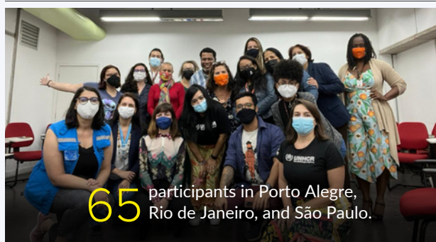
65 participants in Porto Alegre, Rio de Janeiro, and São Paulo.