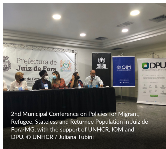
2nd Municipal Conference on Policies for Migrant, Refugee, Stateless and Returnee Population in Juiz de Fora-MG, with the support of UNHCR, IOM and DPU.

On August 5th, with UNHCR's support, the Municipality of Juiz de Fora held the 2nd Municipal Conference on Policies for Migrant, Refugee, Stateless and Returnee Population. The 2nd Conference was an initiative of the Special Secretariat for Human Rights (SEDH) and the Committee for the Development and Monitoring of the Municipal Plan for Migrants, aimed at compiling contributions for the collaborative development of Juiz de Fora's Municipal Plan. UNHCR has provided support for the event and the process of developing the Municipal Plan. More than 85 participants from civil society, local government, and refugee, migrant, and returnee populations participated in the Conference.