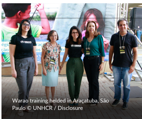
Warao training held in Araçatuba, São Paulo