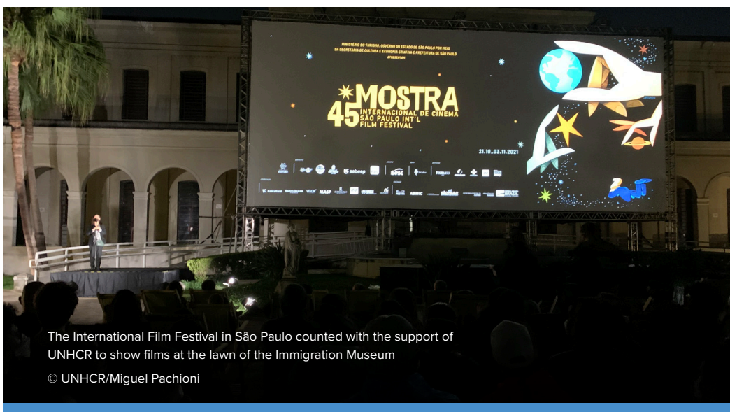
The International Film Festival in São Paulo counted with the support of UNHCR to show films at the lawn of the Immigration Museum

The UN Refugee Agency in partnership with the Immigration Museum of São Paulo, integrated the program of the International Film Festival in São Paulo. Four films, including documentary and fictions, were shown at the lawn of the Immigration Museum for an estimated public of 300 people. The event also counted with the sale of traditional culinary dishes by Syrian and Venezuelan refugee families.