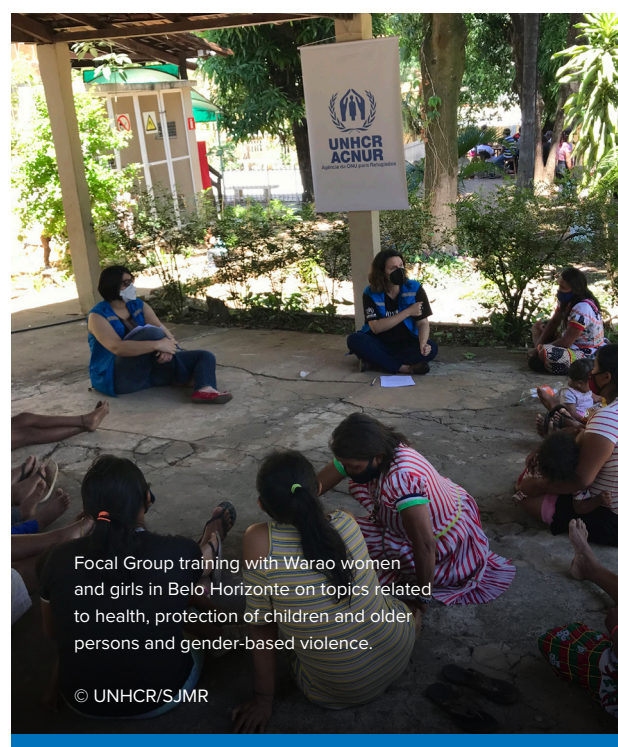
Focal Group training with Warao women and girls in Belo Horizonte on topics related to health, protection of children and older persons and gender-based violence.

In Belo Horizonte, UNHCR São Paulo met with partner entities (Municipal and State Social Assistance Secretariats, Federal Prosecution Service, and Prosecution Service of the State of Minas Gerais, Public Defender's Office and Minas Gerais Police Force, representatives of the legislative power in the state, and SJMR) and with the Warao population to discuss joint protection and integration strategies as part of the discussions around the 1st State Plan for Refugees, Migrants, Stateless Persons and Returnees, and the Bill of Law that aims to institute a specific policy for these populations in Minas Gerais.