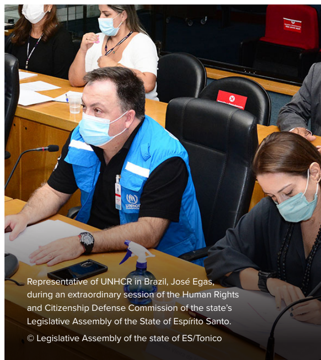
Representative of UNHCR in Brazil, José Egas, during an extraordinary session of the Human Rights and Citizenship Defense Commission of the state's Legislative Assembly of the State of Espírito Santo.

In Vitória, the delegation met with members of the justice system, the Government of the state of Espírito Santo, the Legislative Power and the Dean of the Federal University of Espírito Santo (UFES). This was an opportunity to participate in the Extraordinary Session of the Human Rights and Citizenship Defense Commission of the state's Legislative Assembly, where the promulgation of a project implementing a state policy for the refugee and migrant population was discussed. The Representative visited a local Venezuelan community and coordinated UNHCR's collaboration with state Social Assistance and Human Rights Secretariats, which have been working with all municipalities in the state to strengthen the guarantee of rights to refugees and migrants.