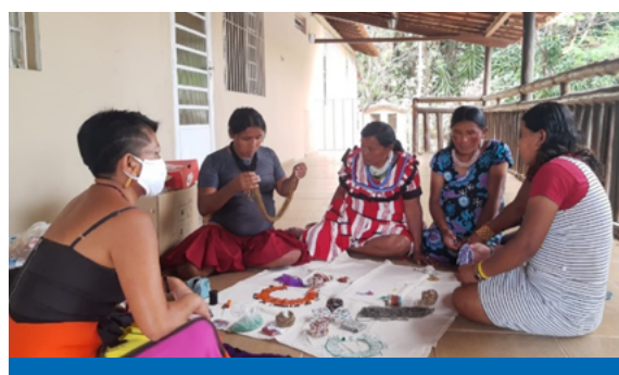
Peaceful coexistence - Warao women in a craft and entrepreneurship workshop with Ticuna indigenous in Belo Horizonte: support of SJMR and the Minas Gerais Indigenous Committee as a result of the Warao GT.

On January 26, UNHCR São Paulo trained 74 employees of the Regional Superintendence of Caixa Econômica Federal (Public National Bank) in Belo Horizonte. In partnership with the Indigenous Committee of Minas Gerais and the Jesuit Service for Migrants and Refugees (SJMR), the training addressed the issue of forced displacement, migration and indigenous population (Warao and other ethnicities), resulting from a recommendation issued by the DPU and the MPF to respond to barriers of access to bank services by indigenous Warao. The demand stems from the multi-actor Working Group, created to support the protection and integration of Warao families in Belo Horizonte. On February 4, UNHCR also trained 15 employees from the Montes Claros public social assistance network, in partnership with IOM. The training addressed the Warao culture, challenges, guidelines and successful practices in assisting this population. Since November 2019, 267 indigenous Warao have been accompanied by UNHCR São Paulo through Working Groups in the cities of Belo Horizonte, Campinas/Hortolândia, Montes Claros, Nova Iguaçu/Japeri, Rio de Janeiro, São Paulo and Uberlândia.