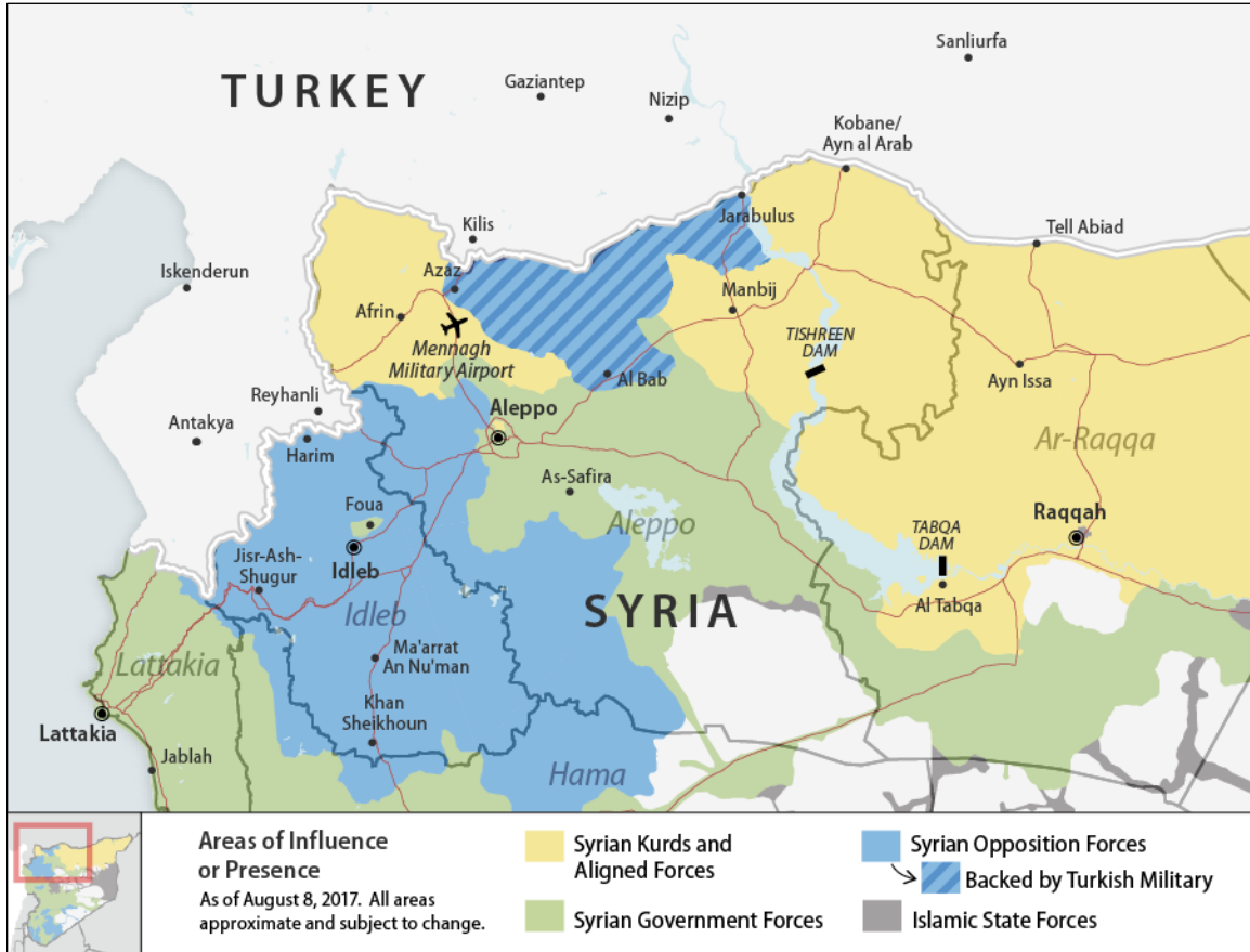
Figure 2. Syria-Turkey Border