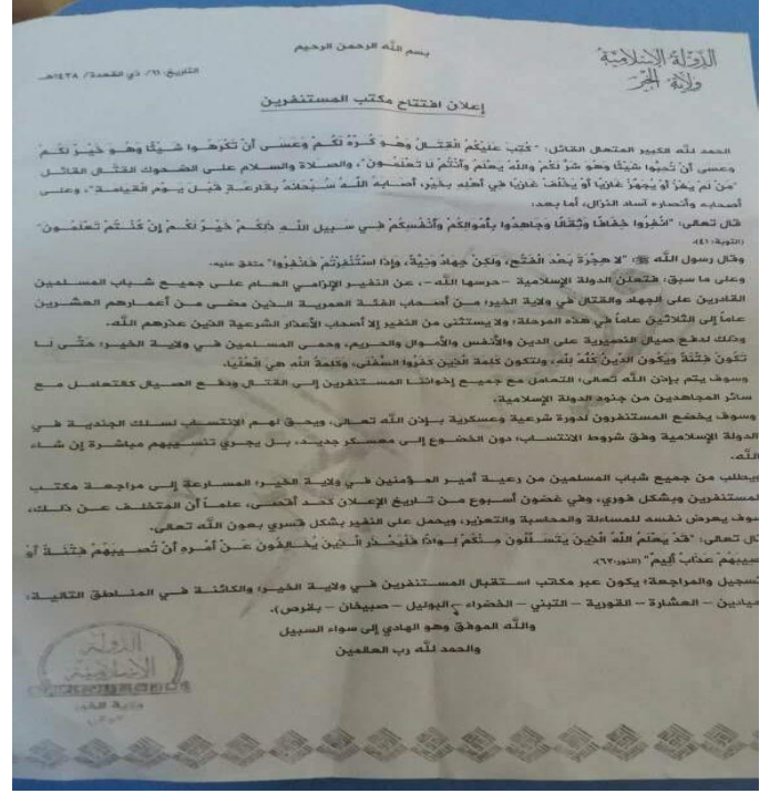
"Anyone who fails to enlist within one week from this announcement will be forcibly deployed to the front lines." -- ISIL order issued on 3 August 2017

In parallel, the number of airstrikes, reportedly carried out primarily by US-led Coalition forces (and to a lesser extent by pro-Government forces, and possibly also Iraqi forces), continued to intensify and affect ISIL-controlled cities, towns, and villages in the Governorate. The majority of such strikes were recorded as taking place in and around the cities of Albo Kamal and Al-Mayadeen with OHCHR receiving