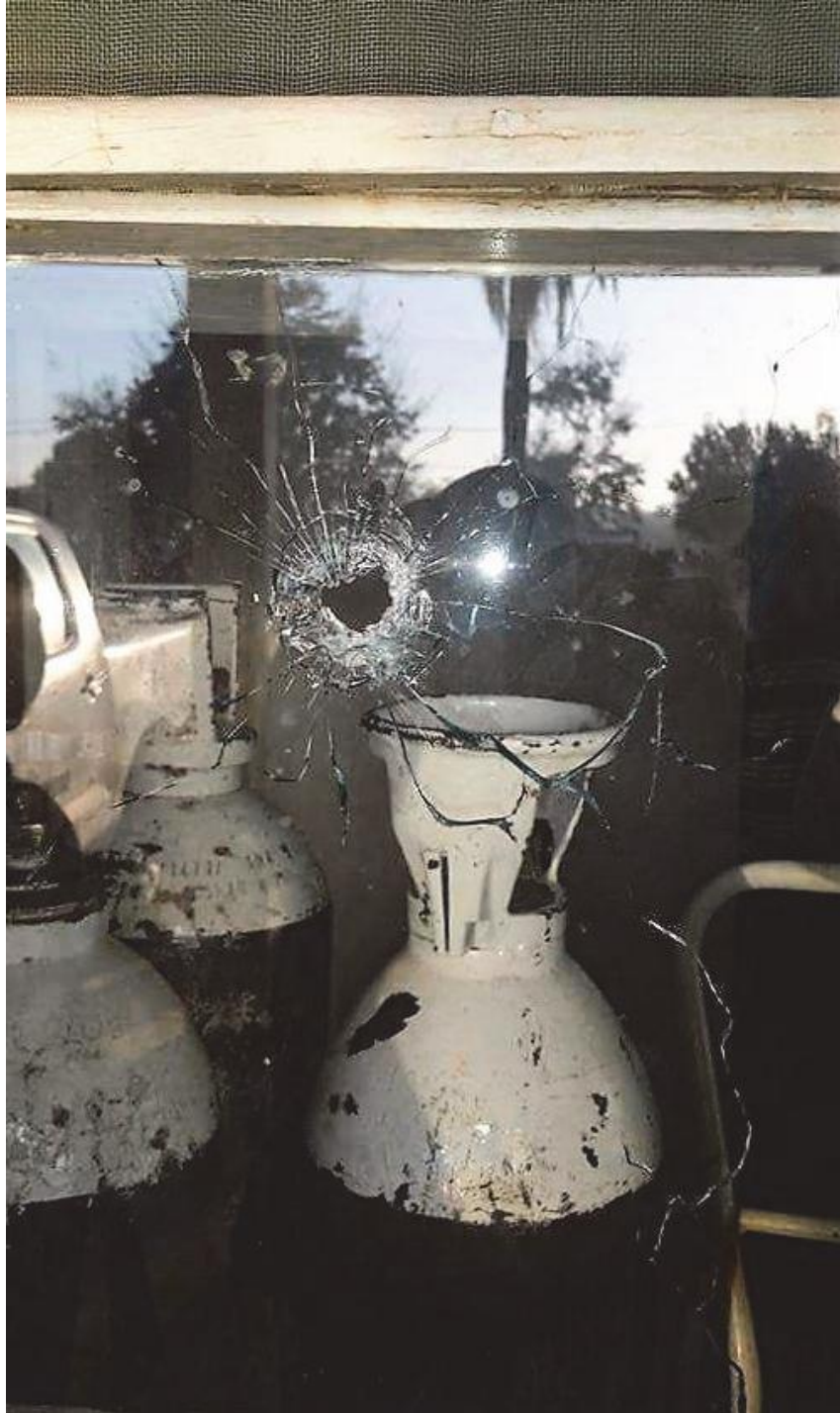
A bullet hole in the window of Morrumbala District Hospital after a raid by Renamo gunmen on August 12, 2016.