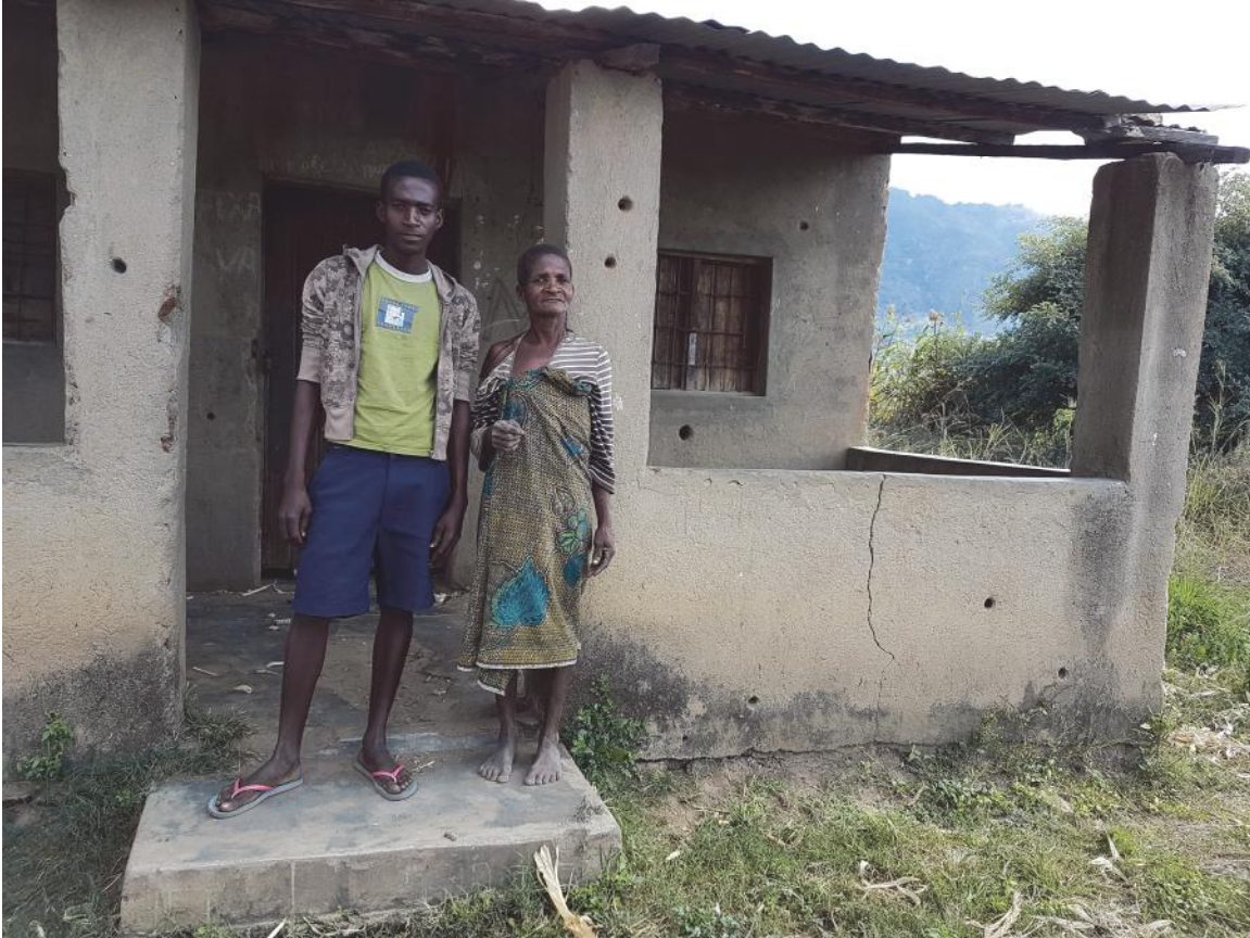
A woman and her son in front of their house with bullet holes in Mukodza village, Gorongosa. They said soldiers arrived in army vehicles and fired without warning at the house in June 2016, forcing them to flee through a window.

Rangers and armored vehicles, used aggressive language and, without warning, set fire to the houses, destroying the residences and barns and killing domestic animals. Residents who tried to remove their possessions from the houses were forced away.