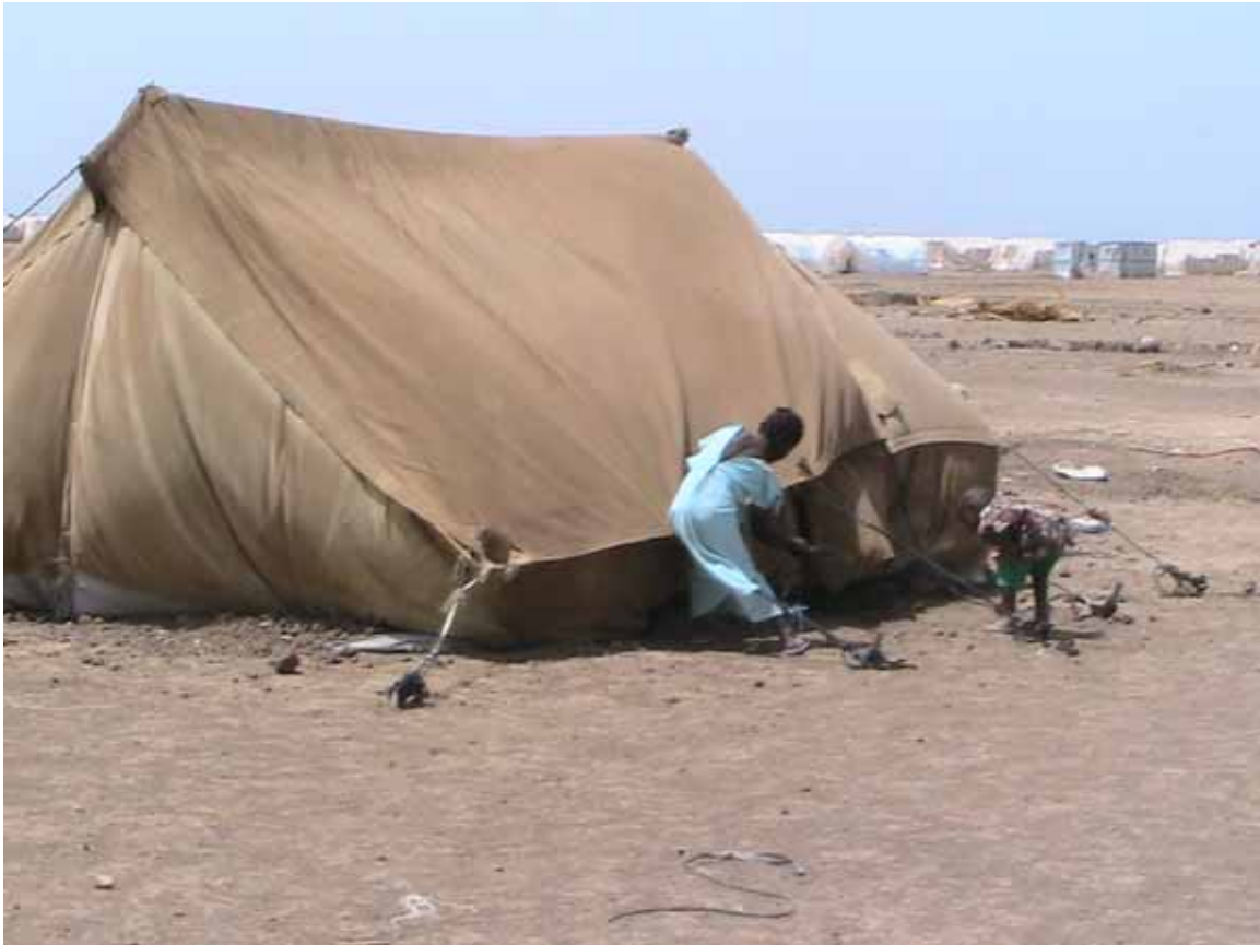
Maltam refugee camp

Maltam was also easy to reach for people travelling back and forth across the border, including Chadian officials. There were numerous reports of Chadian refugees in Kousseri and Maltam, including human rights defenders and journalists, being threatened or becoming aware that unknown individuals, believed to be Chadian security agents, were asking about their whereabouts.