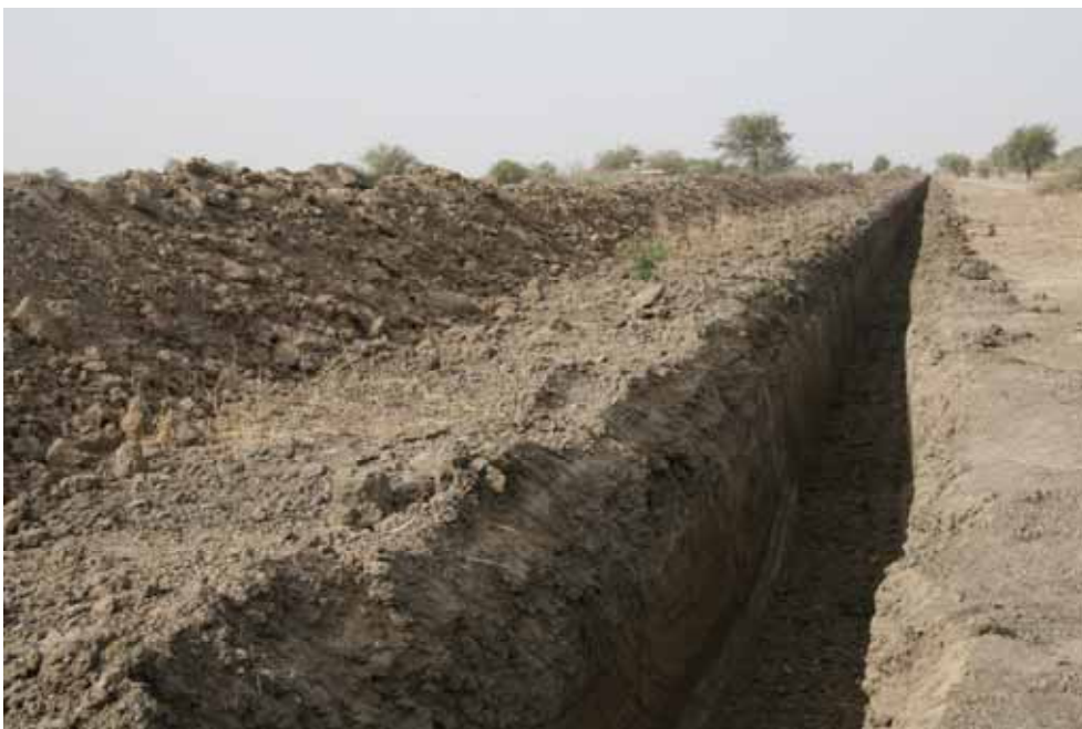
The trench being built around N'Djaména

One woman, a mother of three young children in the neighbourhood of Gassi, described to Amnesty International what happened when she tried to cross the trench: