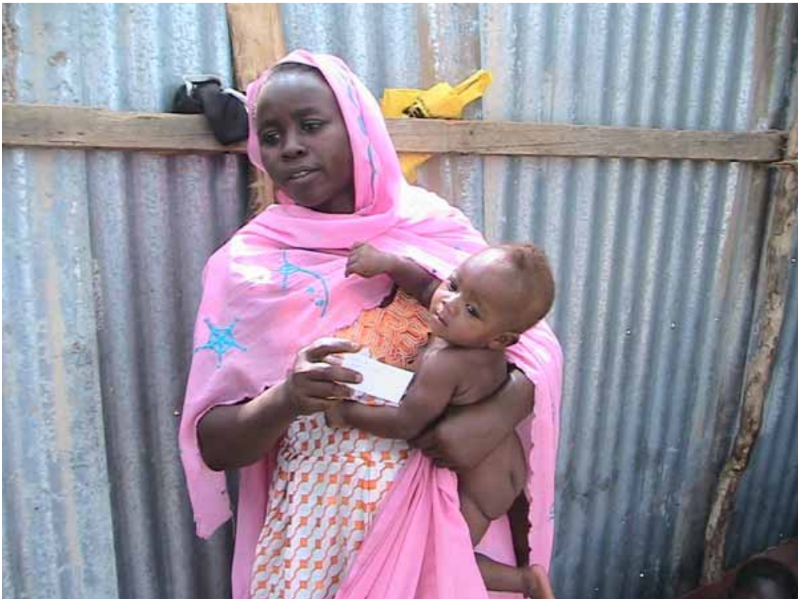
A Chadian woman whose family's home was destroyed: "We are broken – just like our homes"

Chadian woman whose family's home was destroyed