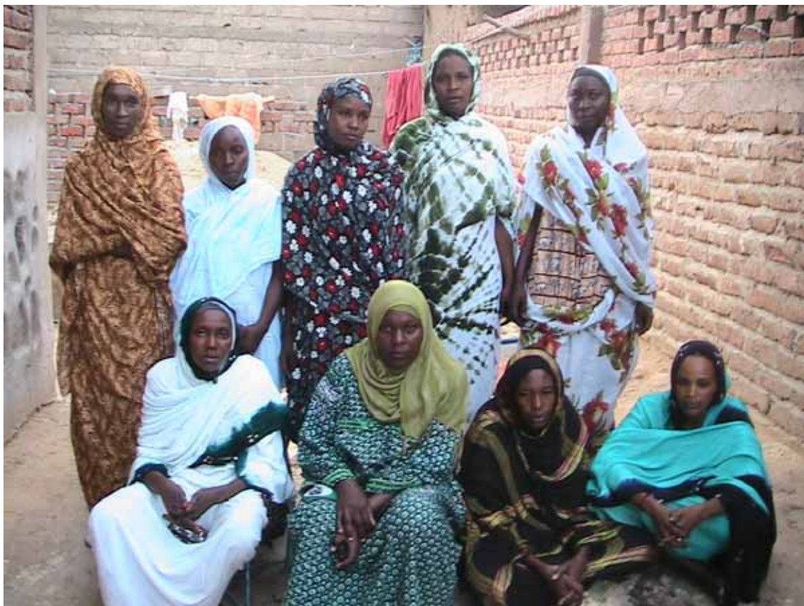
Wives of some of the men who disappeared in April 2006