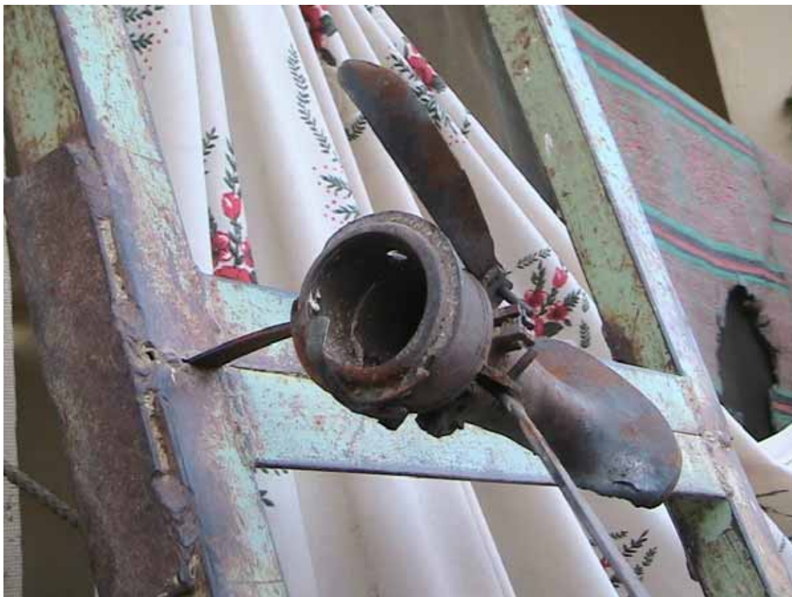
Piece from S-5M 57 mm HE fragmentation rocket

On 12 August 2008, during celebrations in N'Djaména marking the anniversary of Chad's independence, an extensive array of weapons, originating from a variety of countries, was displayed during a military parade. Amnesty International was told that many people, especially children, found the display distressing and that it brought back memories of the fighting in February. 111