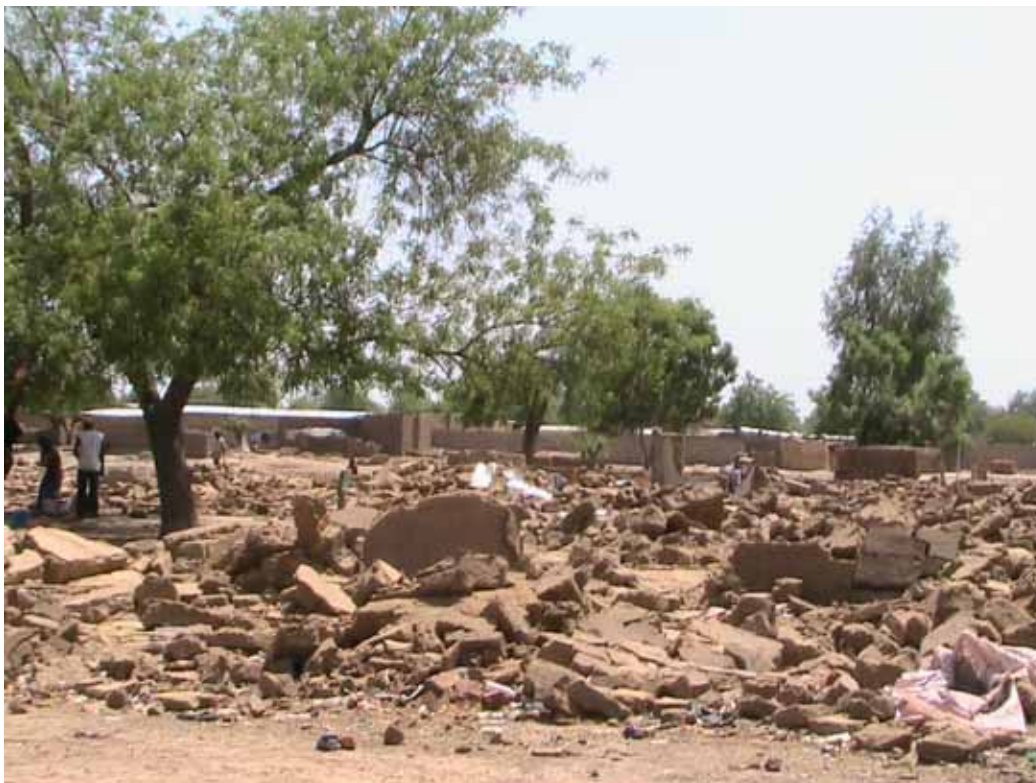
Destruction in Chagoua 2, block 23

" Around 19 February, city hall asked the ward councillor to go from door to door to inform the residents that the houses were going to be demolished. We said nothing because we don't have the power; it was a state of emergency. On 26 February, police and soldiers surrounded the site. The women and children were crying. It was very hard to see a whole life disappear in the space of a few seconds. It was very upsetting; our parents suffered before paying for the land, the building of the houses took time and money. The man there, he cannot cry, he moans to himself. After two hours, the bulldozers had flattened everything. Some people went wherever they could find a place; others went to villages or to Cameroon.