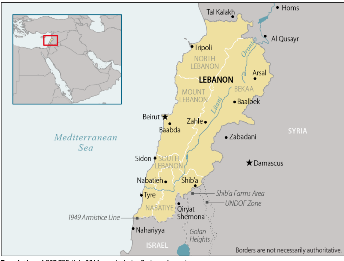
Figure 1. Lebanon at a Glance

Prior to World War I, the territories comprising modern-day Lebanon were governed as separate administrative regions of the Ottoman Empire. After the war ended and the Ottoman Empire collapsed, the 1916 Sykes-Picot agreement divided the empire's Arab provinces into British and French zones of influence. The area constituting modern day Lebanon was granted to France, and in 1920, French authorities announced the creation of Greater Lebanon. To form this new entity, French authorities combined the Maronite Christian enclave of Mount Lebanon—semi-autonomous under Ottoman rule—with the coastal cities of Beirut, Tripoli, Sidon, and Tyre and their surrounding districts. These latter districts were (with the exception of Beirut) primarily Muslim and had been administered by the Ottomans as part of the vilayet (province) of Syria.