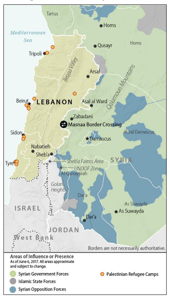
Figure 3. Lebanon-Syria Border