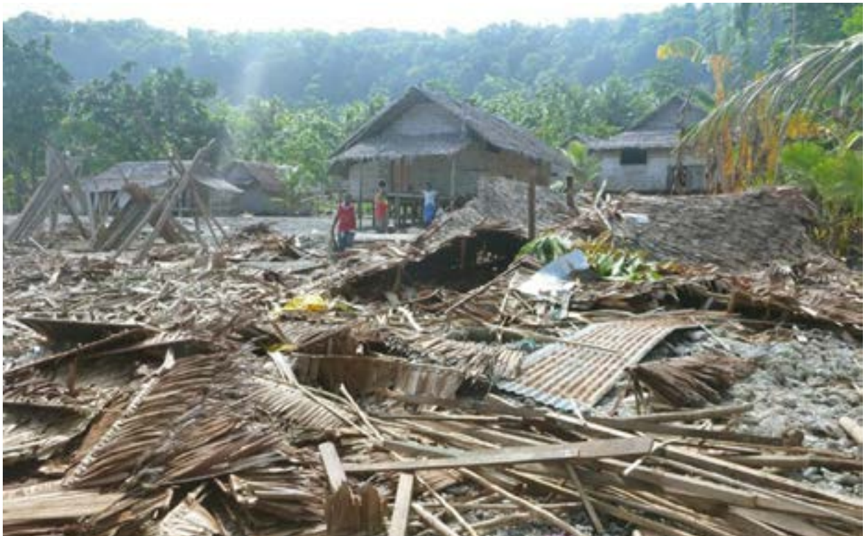
Destruction caused by the earthquake in Santa Cruz Island, Temotu Province, Solomon Islands.

This pledge was welcomed by several states and provides the basis of the Nansen Initiative. The first sub-regional consultation occurred in May 2013 and was hosted by the Cook Islands. This paper was prepared as an input into the ongoing Nansen Initiative process and the key findings of an early draft were presented at the Pacific consultation.