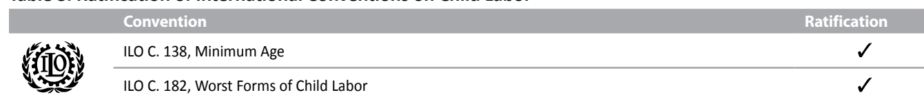
Table 3. Ratification of International Conventions on Child Labor

Samoa has ratified most key international conventions concerning child labor (Table 3).