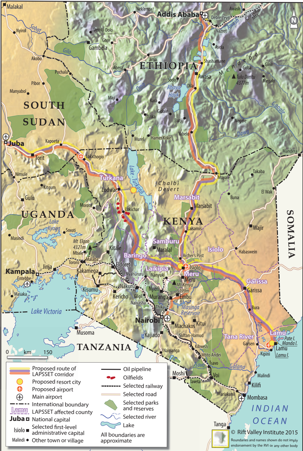
Map 3. Kenya, showing the proposed LAPSET corridor and associated infrastructure