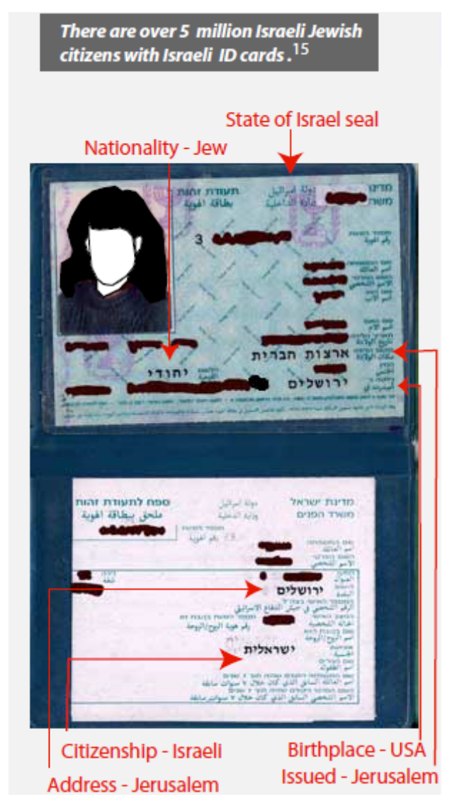
[The footnote '15' above refers to the original source]

"These cardholders have total access to Jerusalem and freedom of movement in most of the West Bank. Although a holder of an Israeli ID card, someone listed as 'Arab' is more likely to be questioned, delayed and at times denied access.16 While there is no restriction on the movement of persons with Israeli ID cards, there is a military order prohibiting entry into West Bank Palestinian cities. The Jerusalem Wall will restrict their movement in Palestinian areas." [54a]