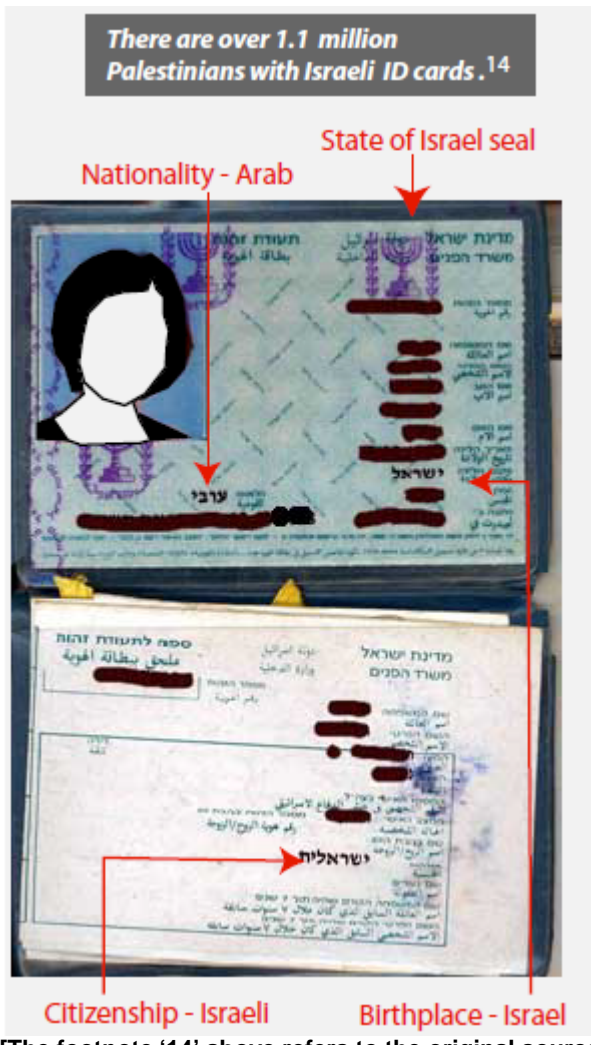
[The footnote '14' above refers to the original source]

in use list the national-ethnic or religious identity. The bottom half of the ID card lists citizenship as Israeli.