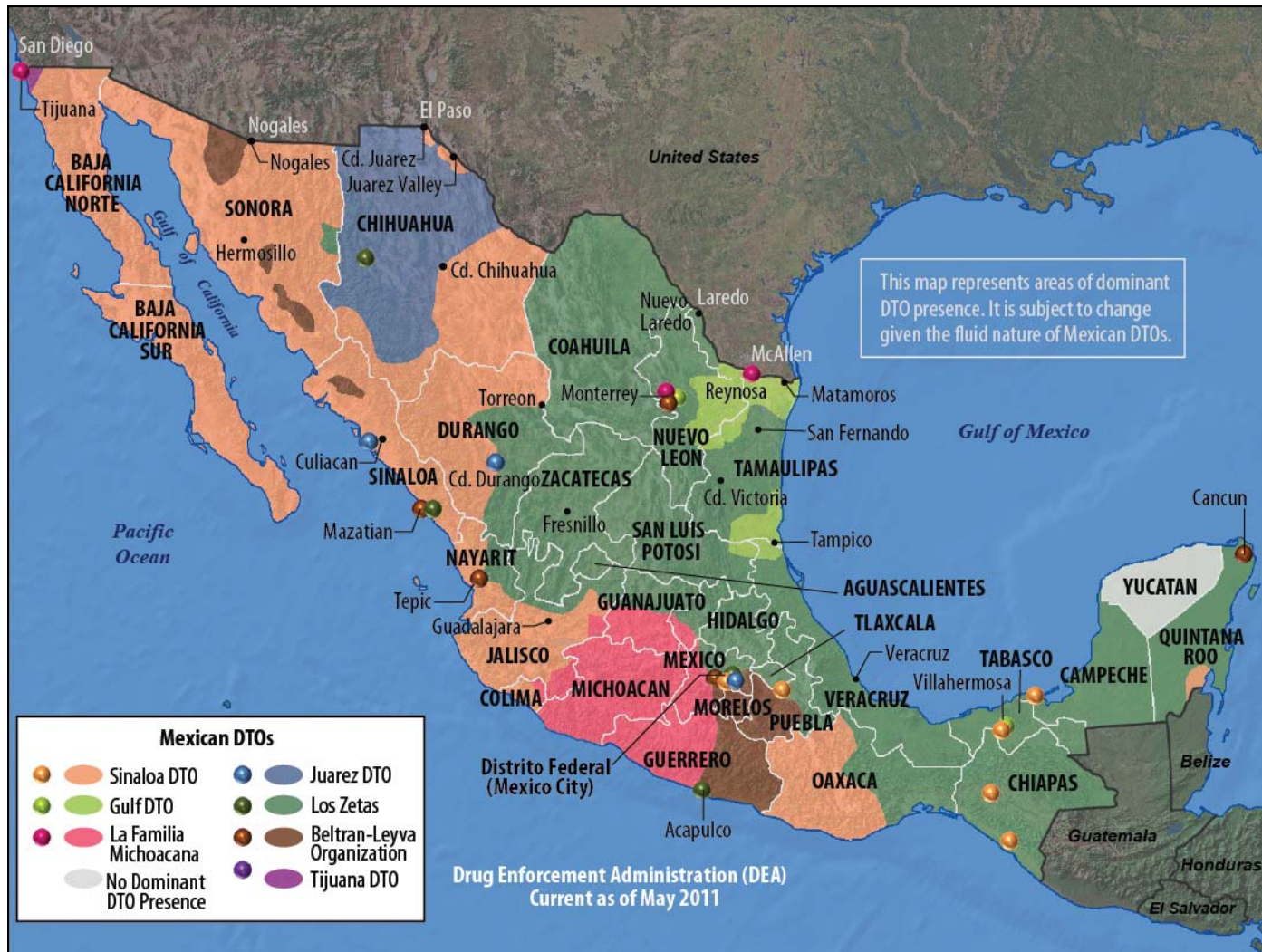
Figure I. Map of DTO Areas of Dominant Influence in Mexico