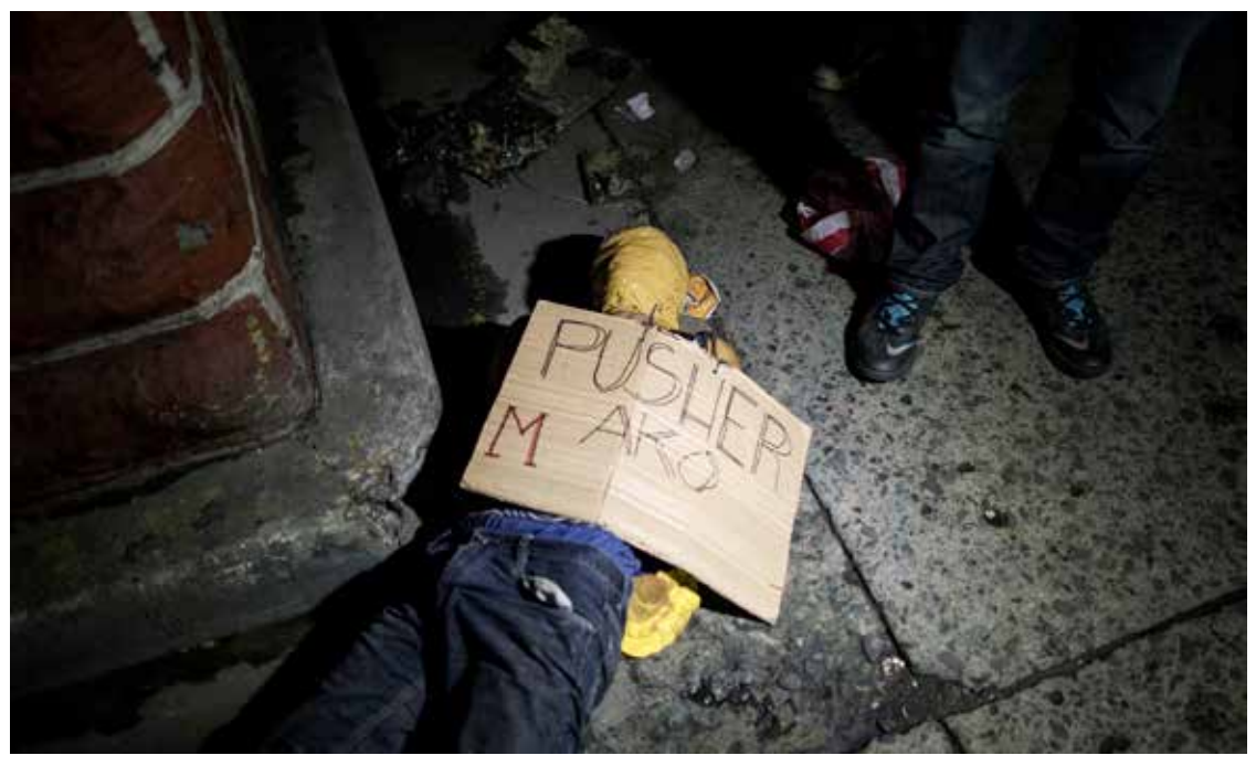
In this picture taken on 8 July 2016, police officers examine the dead body of an alleged drug dealer, his face covered with packing tape and a placard reading "I'm a pusher," on a street in Manila.

In addition, the spate of summary killings of drug peddlers in the Philippines since the election of President Duterte is cause for concern. According to police figures, 39 suspected drug dealers were killed from the start of the year until the 9 May 2016 presidential election.<sup>42</sup> Since 1 July 2016, police officers and vigilantes have been responsible for 3,671 reported cases of extrajudicial killings of suspected criminals in relation to President Duterte's 'war on drugs.'43 The recent dramatic increase in the number of extrajudicial killings appears to be a direct consequence of statements made by President Duterte, including encouraging the use of vigilante justice and pledging to kill up to 100,000 criminals during his first six months in office in order to eradicate crime and corruption.44