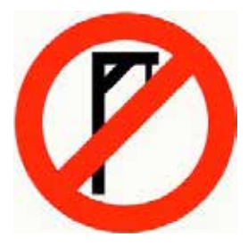
Singapore Anti-Death Penalty Campaign (SADPC)

Malaysians Against Death Penalty and Torture (MADPET)