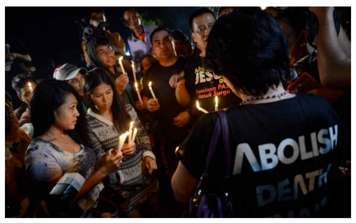
A group of Christians hold a candlelight vigil to protest the death penalty at Nusakambangan port in Cilacap, Central Java, across from Nusakambangan prison on 29 April 2015.

Proposed and newly enacted legislation contain provisions that add the imposition of the death penalty for existing crimes. Proposed amendments to the 2003 Anti-Terrorism Law, which is under consideration by Parliament, would make certain offenses punishable by death. On 25 May 2016, President Widodo signed a decree that amended the 2002 Child Protection Law to introduce capital punishment for individuals convicted of committing sexual violence against children.<sup>21</sup> The death penalty would be imposed in cases where the victims died or suffered serious mental or physical injury.<sup>22</sup> The decree is awaiting ratification by the House of Representatives.