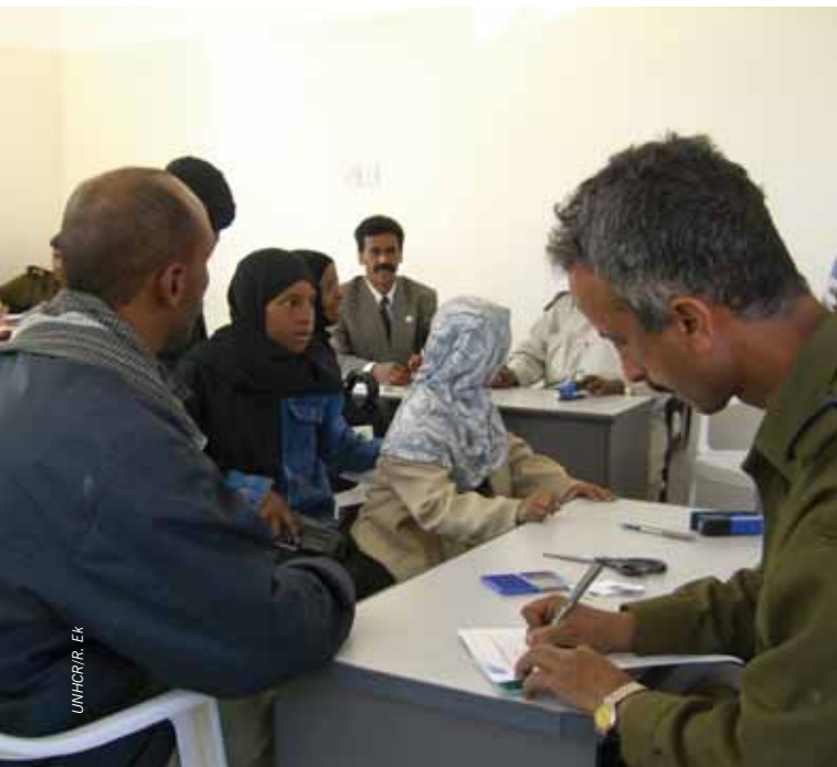
Registration of Somali refugees in Sana'a.

for some of them. UNHCR is endeavouring to improve their living conditions in Yemen.