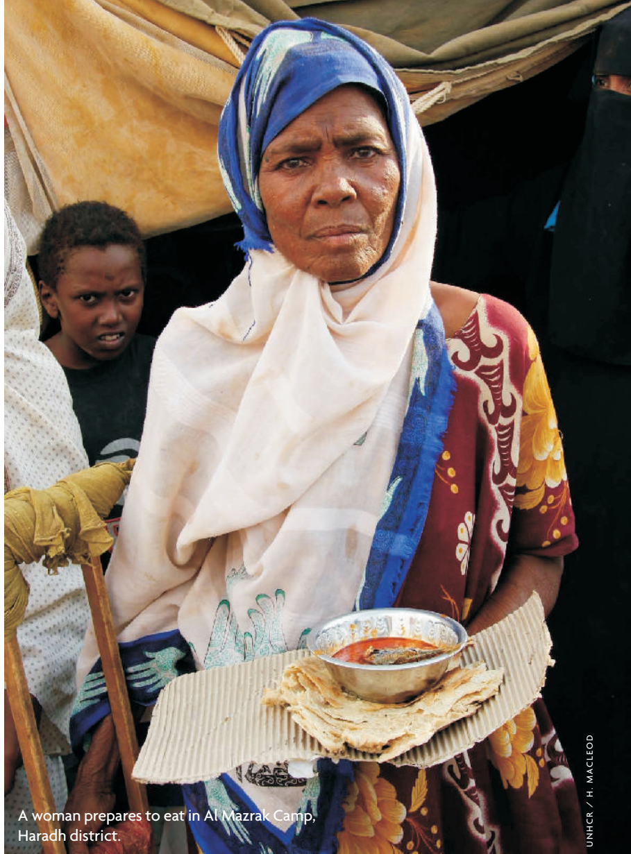
A woman prepares to eat in Al Mazrak Camp, Haradh district.

Durable solutions were only available for a small number of refugees. Repatriation is not an option for Somali refugees in Yemen given the volatile situation in Somalia, and opportunities for local integration are limited. In this respect, the Office began developing a strategy to increase resettlement opportunities for those who have no other alternatives.