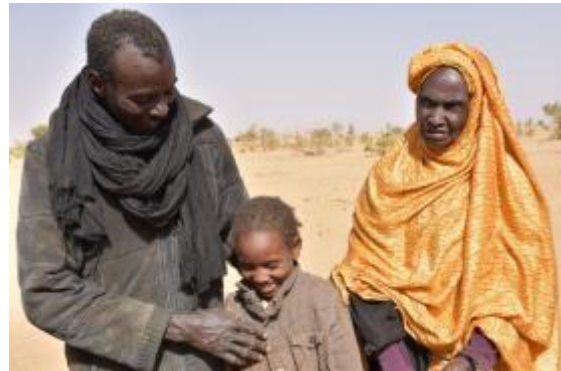
Boughlingala residents wear newly distributed jackets to protect them from the cold season.