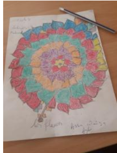
The winner of a drawing context held in one of the six primary schools in Mbera refugee camp.