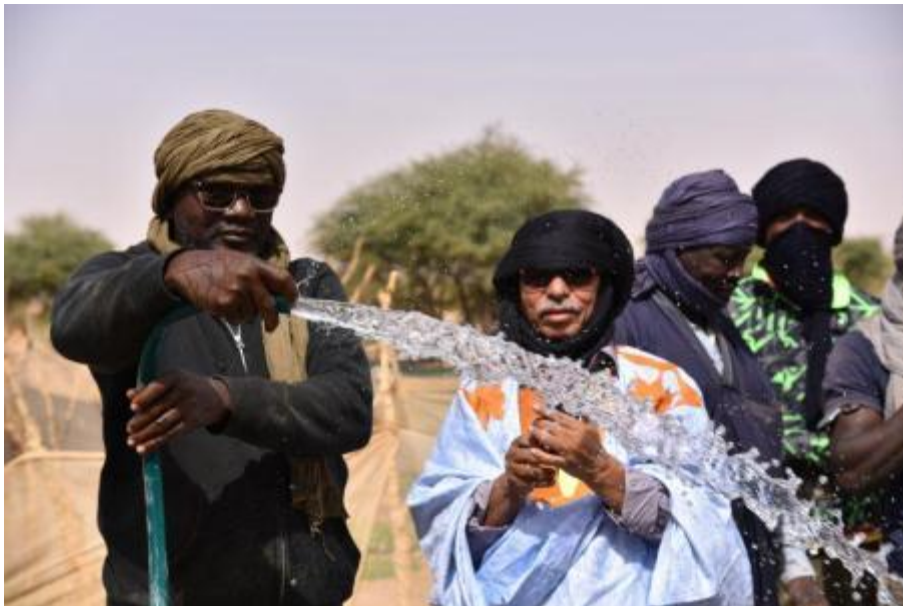
UNHCR and its partner SoS Desert improved access to water for the host communities in Boulinghala village, located some 15 km from Bassikounou, in the area surrounding Mbera refugee camp. Thanks to an improved well, the communities have started gardening.

Since 2012, UNHCR has led the humanitarian response for Malian refugees in the Hodh ech Charghi region, in collaboration with the Mauritanian Government, which continues to keep its borders open to new influxes, and in cooperation with other UN agencies, national and international NGOs. Despite the conclusion of a peace agreement in Mali in June 2015, large-scale returns of refugees are not yet expected due to the security situation in northern Mali. In June 2016, Mauritania, Mali and UNHCR concluded a Tripartite Agreement for the voluntary repatriation of Malian refugees. This agreement will provide a framework to facilitate voluntary return, when the conditions in Mali will allow. In the meantime, it reaffirms the commitment of Mauritania and Mali to protect refugees.