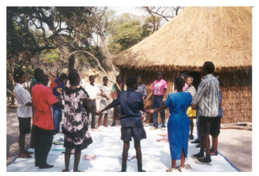
Peer education youth group in Nangweshi camp.

incidents are sometimes resolved by the victims' families forcing the perpetrator to marry the victim. Victim Support Units (VSU) are in place at camp police stations and some focus group participants acknowledged awareness of these services. However, it is not clear that the VSU staff are appropriately trained to serve victims of violence. CARE has recently been funded to implement GBV projects in Mwange and Nangweshi camps and part of their work will be to collaborate with the police department, provide necessary training, and strengthen the links between the refugees and VSUs so appropriate referrals can be made.