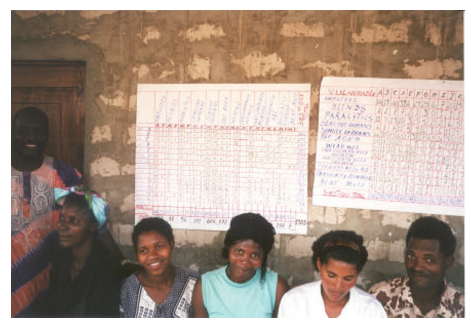
Community Development Workers in Nangweshi Camp shown with the charts they use to track camp residents.

In general, most refugees - with the exception of the urban/peri-urban refugee population, which suffers from transportation and communication barriers - have good access to safe motherhood services. The extent of unsafe abortion demands additional study. The availability of the Minimum Initial Services Package in transit centers and other areas where arriving refugees cross into the country was not investigated. Both of these areas require further exploration to determine the level of need. Supplies for syphilis testing of pregnant women are not consistently available.