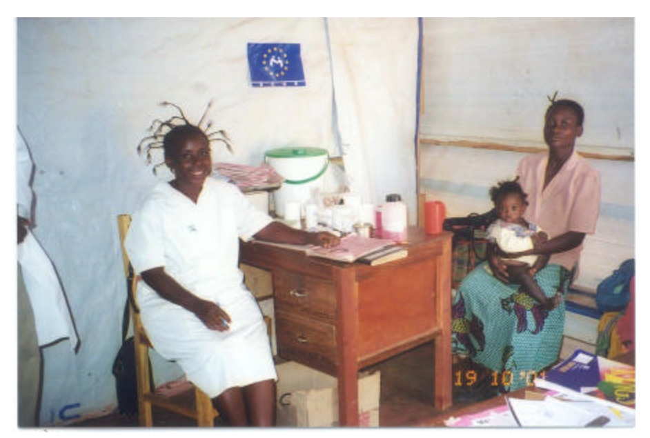
Maternal and child health clinic in Mwange Camp

Mwange camp is located in the Mporokoso District in the Northern Province near the border of northern Zambia. It is home to approximately 23,000 Congolese refugees since 1999.