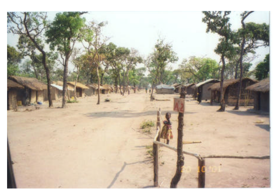
Kala Refugee Camp

Safe Motherhood Comprehensive ANC services (including syphilis testing) are provided and are well attended. In August 2001, 21 percent of syphilis tests were positive. Approximately 85 percent of deliveries are performed at the camp