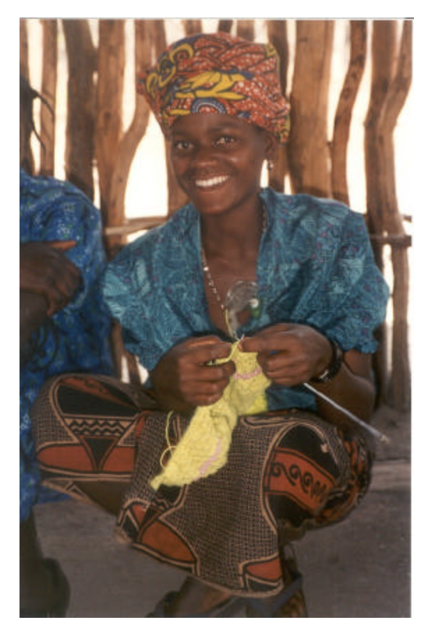
Angolan refugee participating in a women's craft club in Nangweshi camp.

Communication is one area in which reproductive health for refugees (RHR) programming could be strengthened. The team recognizes that this weakness could be a result of the renewed energy for RHR and that people and NGOs may not have caught up yet with the increase in information flow. The team would also like to emphasize that RH is an extremely broad area, with many new and challenging technical areas. Therefore, collaboration among partners is crucial to utilizing scarce resources efficiently and achieving improvements in the availability of reproductive health for refugees. The team would also like to note that there are differences between the camps in Zambia, which reflects good potential for sharing of expertise among camps. Although certain camps may have already addressed some of these suggestions, the team hopes that the recommendations from this assessment will highlight the most urgent needs to be addressed and offer an opportunity for increased technical support and guidance for all involved.