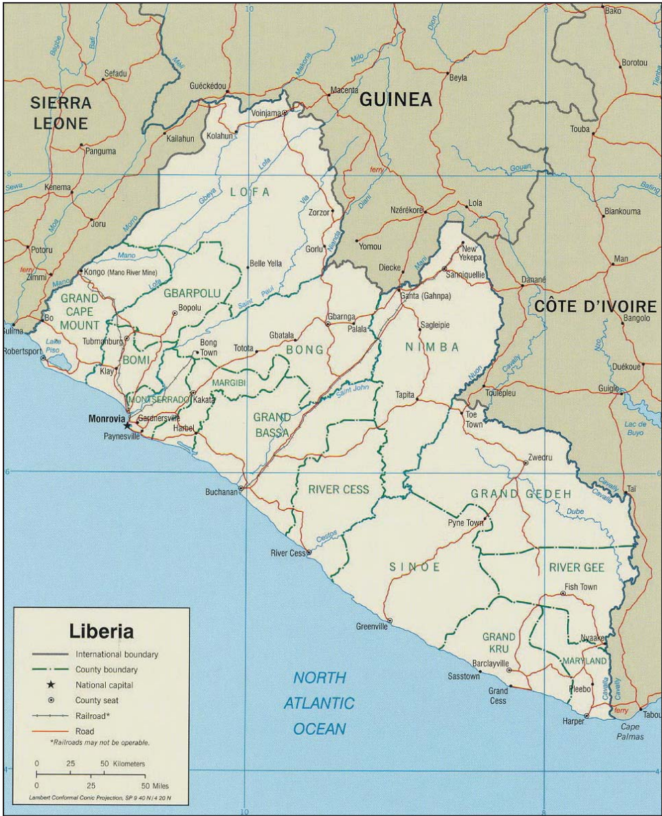
Map 1—Liberia Country Map, 2004