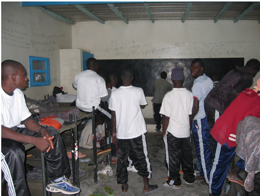
Migrants in the Nouadhibou Detention Centre

Corroborating information indicates that some members of the security forces do carry out arbitrary arrests of foreign nationals, notably nationals of ECOWAS countries. These people, arrested in the street or at home, apparently without any evidence, were allegedly accused of intending to leave Mauritania irregularly to travel to Europe. Some of these people, held at the detention centre at Nouadhibou to await being sent back to Mali or Senegal, told the Amnesty International delegation that they were legally present in Mauritania and that, at the time of their arrest, the security forces had torn up their residence permits. Amnesty International fears that these arbitrary arrests are one of the perverse effects of the pressure exerted by the EU on the Mauritanian government.