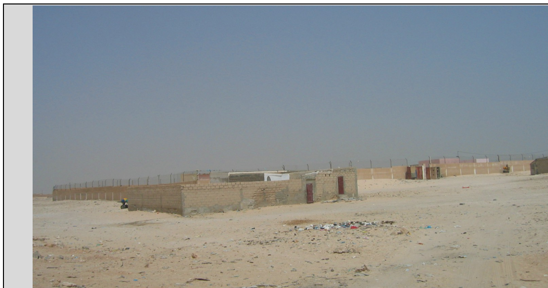
Nouadhibou Detention Centre

The centre, which is not governed by any regulations applicable to Mauritanian detention centres, does not appear to have an official name, either. The Regional Director of National Security in Nouadhibou told Amnesty International that the Mauritanian authorities referred to it as the “reception centre for clandestine migrants”. The Spanish Consul in Nouadhibou has said that the Spaniards called the centre “internment centre or detention centre” ( Centro de internamiento o centro de retención ). The migrants held at the centre refer to it as the “Red Cross Centre”, while other inhabitants of Nouadhibou and some migrants call it “ Guantanamo ”. 24 This uncertainty as to the name of the centre is a further indication of the absence of any legal character for this detention centre.