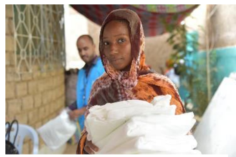
Mosquitos net distribution to urban refugees and asylum-seekers in Nouakchott.

In urban areas, in collaboration with the Mauritanian Ministry of Health National Program for the Fight against Malaria (PNLP) , during the month of September the mosquito net distribution for refugees and asylum seekers continued for those who could not receive it at the first distribution in August.