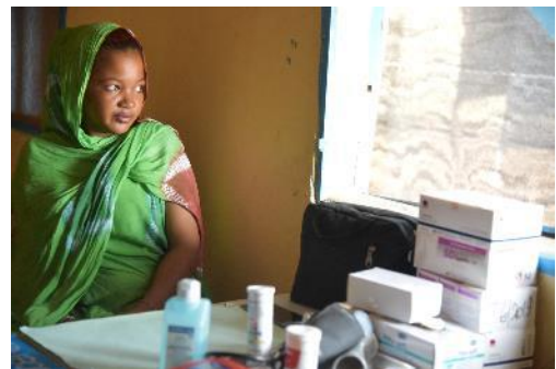
A nurse in one of the health posts in Mbera camp

In addition, 331 urban refugees received health assistance including check-ups, medical visits and surgeries.