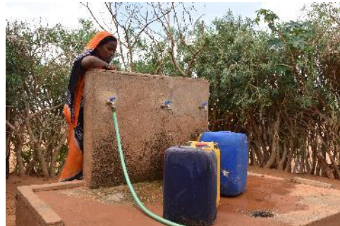
A refugee woman fills her jerry can at one the water point in Mbera camp

In September in Mbera camp , UNHCR carried out hygiene promotion activities focused on strengthening hygiene practices through different awareness raising techniques (door to door, focus groups, educational talks, meetings, mass session) at households and main meeting points (water points, washing areas, latrines). The interventions reached out 4,263 men, 4,255 women, 3,278 girls and 2,148 boys.