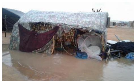
One of the tents hit by floods in Mbera camp

Case-by-case needs assessments and recommendations were made jointly with UNHCR protection partner in the camp, World Vision. Moreover, UNHCR also distributed CRIs (blankets, mosquito nets, jerry cans, soaps and colanders) to more than 800 families from the host community .