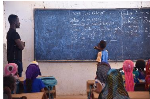
A teacher giving remedial classes to his students in one of the six schools in Mbera camp

In September, in order to support Malian and urban refugees tertiary education, UNHCR launched a call for applications for DAFI scholarships for the academic year 2018-2019 . The qualified candidates will be notified at the end of October 2018.