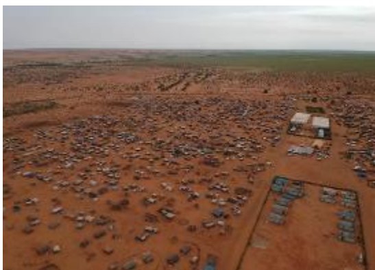
Aerial view from Mbera camp