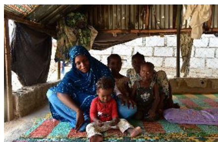
A Central African refugee mother with her children in their tent in Nouakchott

In order to strength and build adequate referral pathways, advocate for inclusion of refugees in all national protection mechanisms UNHCR is meeting with partners in order to bring refugee issues in key child protection ongoing discussions.