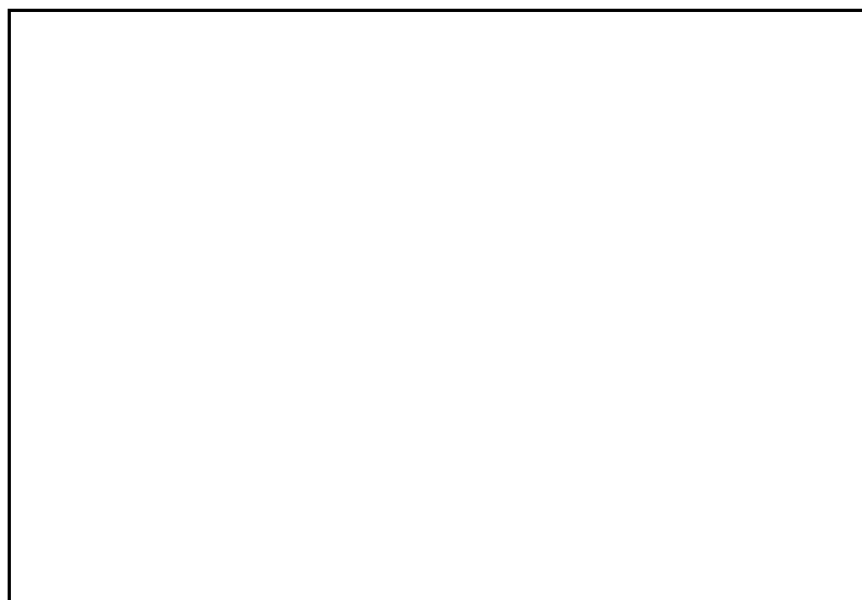
Hatshepsut Temple, site of the massacre of tourists on 17 November 1997

The deadliest massacre of civilians that Egypt witnessed in recent years was the Luxor massacre which took place on 17 November 1997. That day at around 9am 58 foreign tourists and four Egyptians were killed in an armed attack at a historical site near Luxor. The six gunmen who carried out the attack were later killed by the security forces