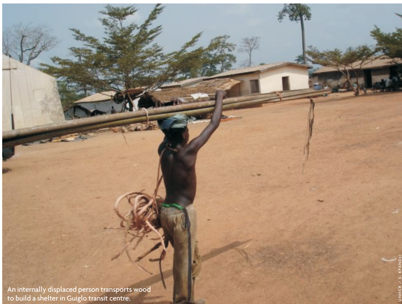
An internally displaced person transports wood to build a shelter in Guiglo transit centre.

A joint action plan was established in collaboration with the relevant ministries, and a joint evaluation of the potential areas of return established the needs of the population. A bridge was constructed in the Danane area and the ferry at Prollo was renovated to facilitate the repatriation of refugees from and to Côte d'Ivoire.