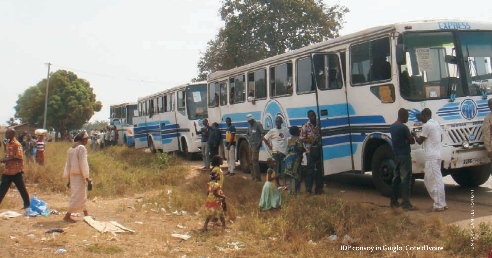
IDP convoy in Guiglo, Côte d'Ivoire