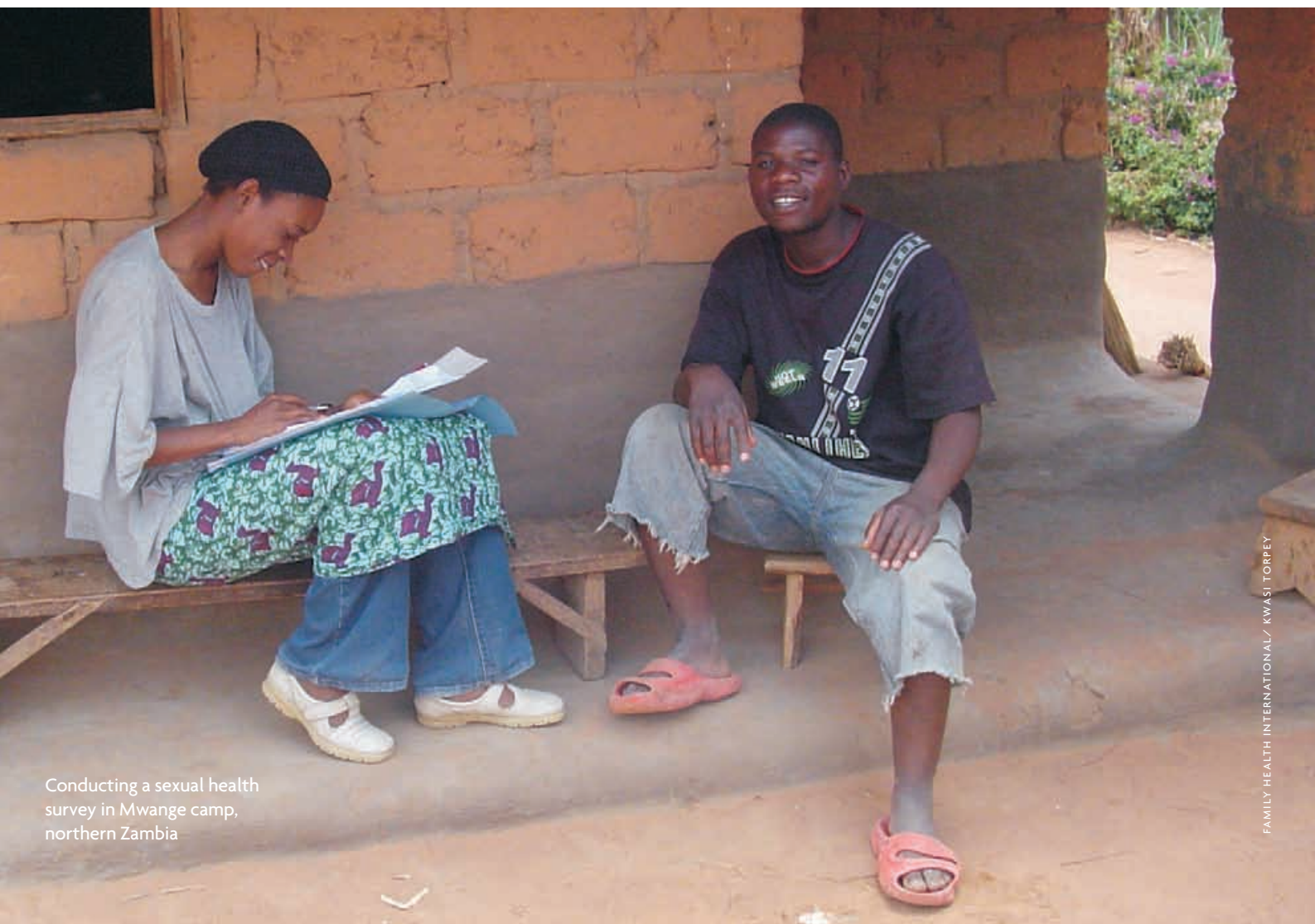
Conducting a sexual health survey in Mwange camp, northern Zambia

Water: All those living in the Mwange and Kala camps had access to safe drinking water. Refugee committees in the Meheba and Mayukwayukwa settlements worked with the Department of Water Affairs to maintain water points. The average water consumption in the camps and settlements was 20 litres per person per day. Committee members were trained to repair the system with minimal support from the implementing partner.