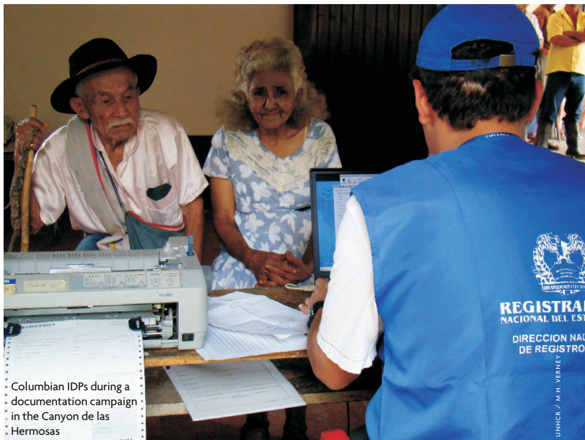
Columbian IDPs during a documentation campaign in the Canyon de las Hermosas

In 2009 the Colombian authorities ensured access to asylum procedures for an increasing number of extra-regional asylum-seekers, some of them victims of international trafficking networks.