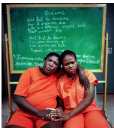
The INS often detains asylum seekers for prolonged periods in local jails and correctional facilities. Families are frequently split up.

For months, the Bush Administration denied that there had been a change in policy. It was not until March 2002 that the INS finally admitted in federal court that after consultation with other affected federal agencies, its headquarters had issued a directive to its Miami District to discontinue the release of Haitian asylum seekers unless it explicitly approved parole. 164