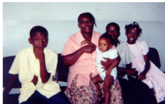
A woman and her four children were forced to flee Haiti because of her political activities.