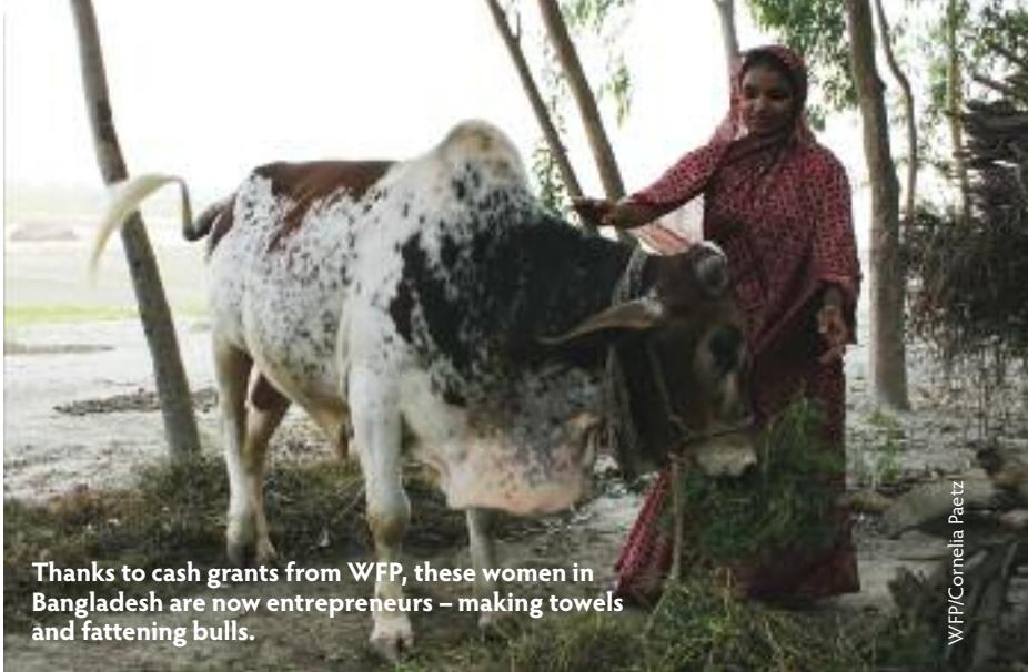
Thanks to cash grants from WFP, these women in Bangladesh are now entrepreneurs – making towels and fattening bulls.

their grain for home consumption and sale. And by cultivating more land and investing in no-till farming and other sustainable practices, they are buffering the impact of future shocks in a region prone to natural disasters.