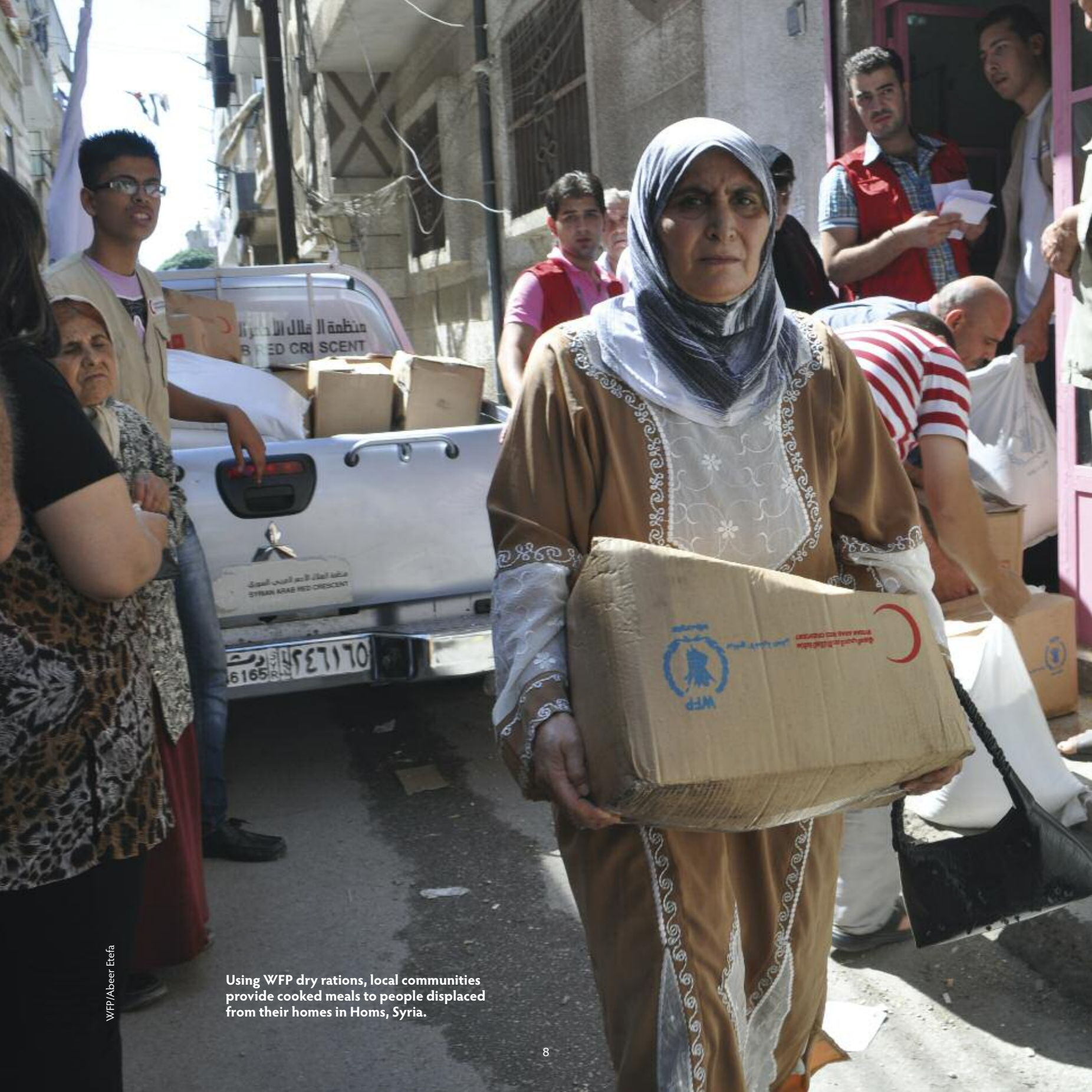
Using WFP dry rations, local communities provide cooked meals to people displaced from their homes in Homs, Syria.