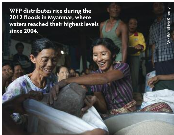
WFP distributes rice during the 2012 floods in Myanmar, where waters reached their highest levels since 2004.

2013, but is expected to extend beyond this date. "While WFP will continue to assist the displaced, we will also have to find a way to continue the important work we were already doing to ensure the poorest have nutritious food on the family table," Veloso says.