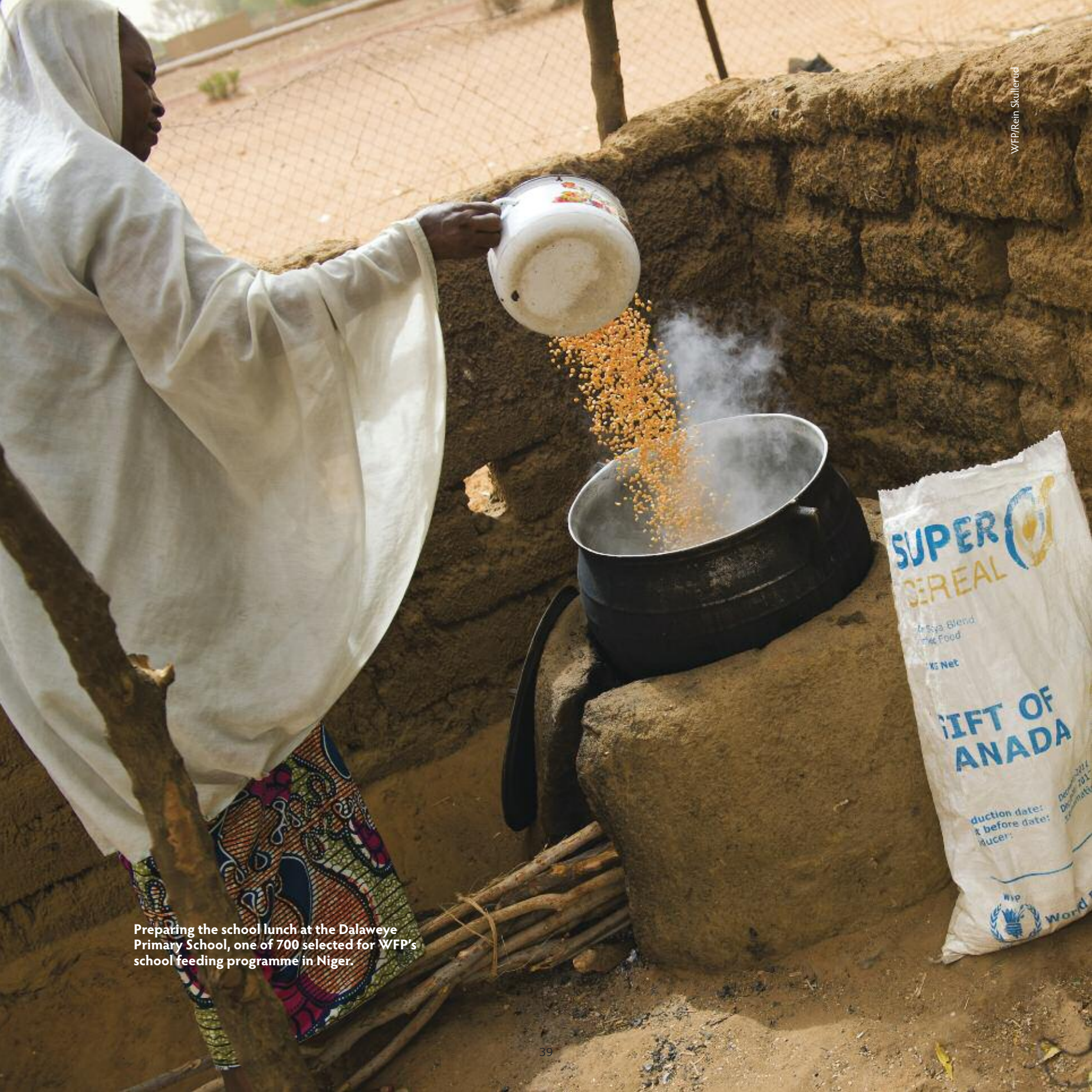
Preparing the school lunch at the Dalaweys Primary School, one of 700 selected for WFP's school feeding programme in Niger.