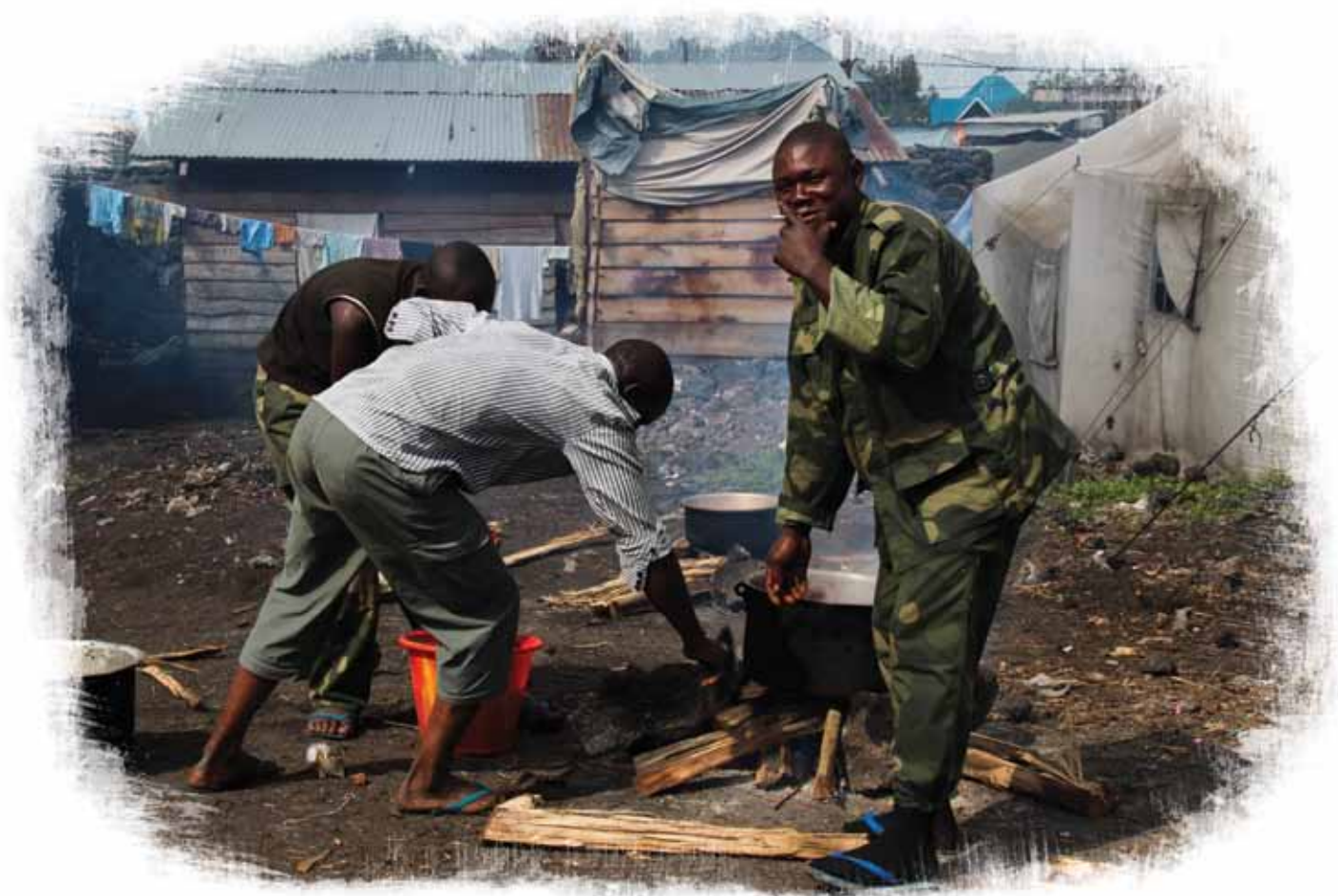
Soldiers cooking their breakfast on a campfire. Many troops are missing basic requirements like military issue boots.